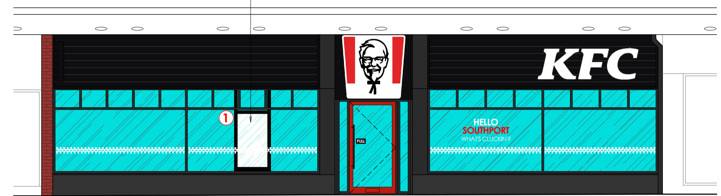
Proposed Eastbank Street Elevation scale - 1:50 @ A1 / 1:100 @ A3

NEW DOUBLE SIDED DIGITAL EGP LOCATED BEHIND GLASS, ELECTRICIAN TO PROVIDE POWER & DATA. IMPORTANT NOTE: PIONEER TO PROVIDE BESPOKE HEIGHT OF STAND.