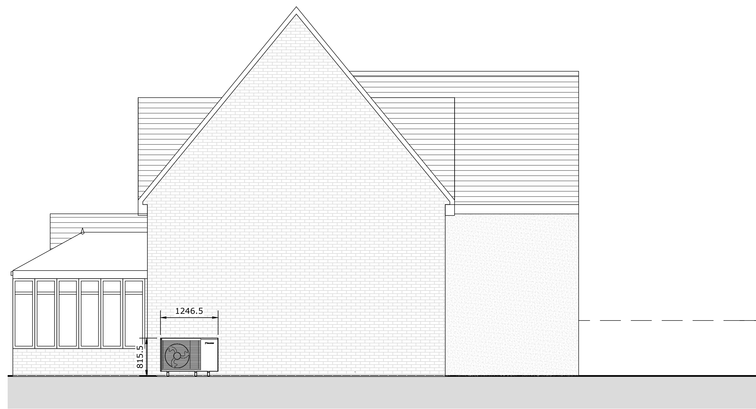
West Elevation as PROPOSED 1:50