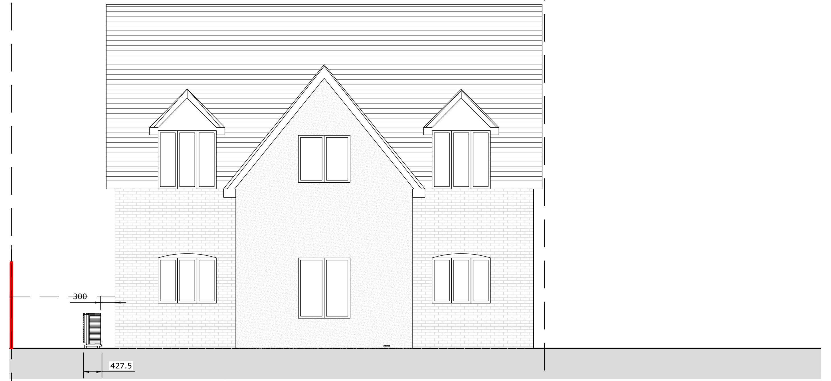
South Elevation as PROPOSED 1:50