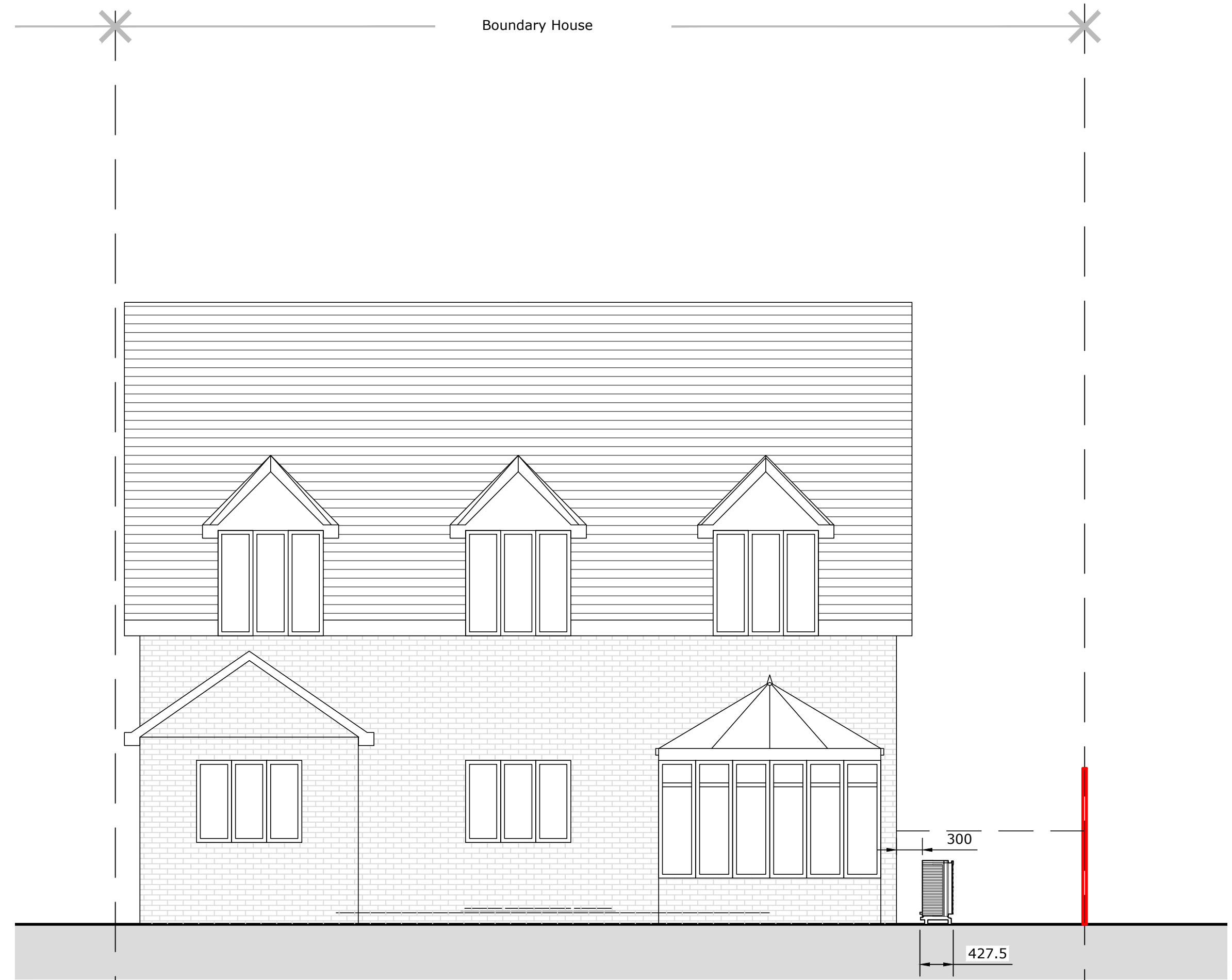
North Elevation as PROPOSED 1:50