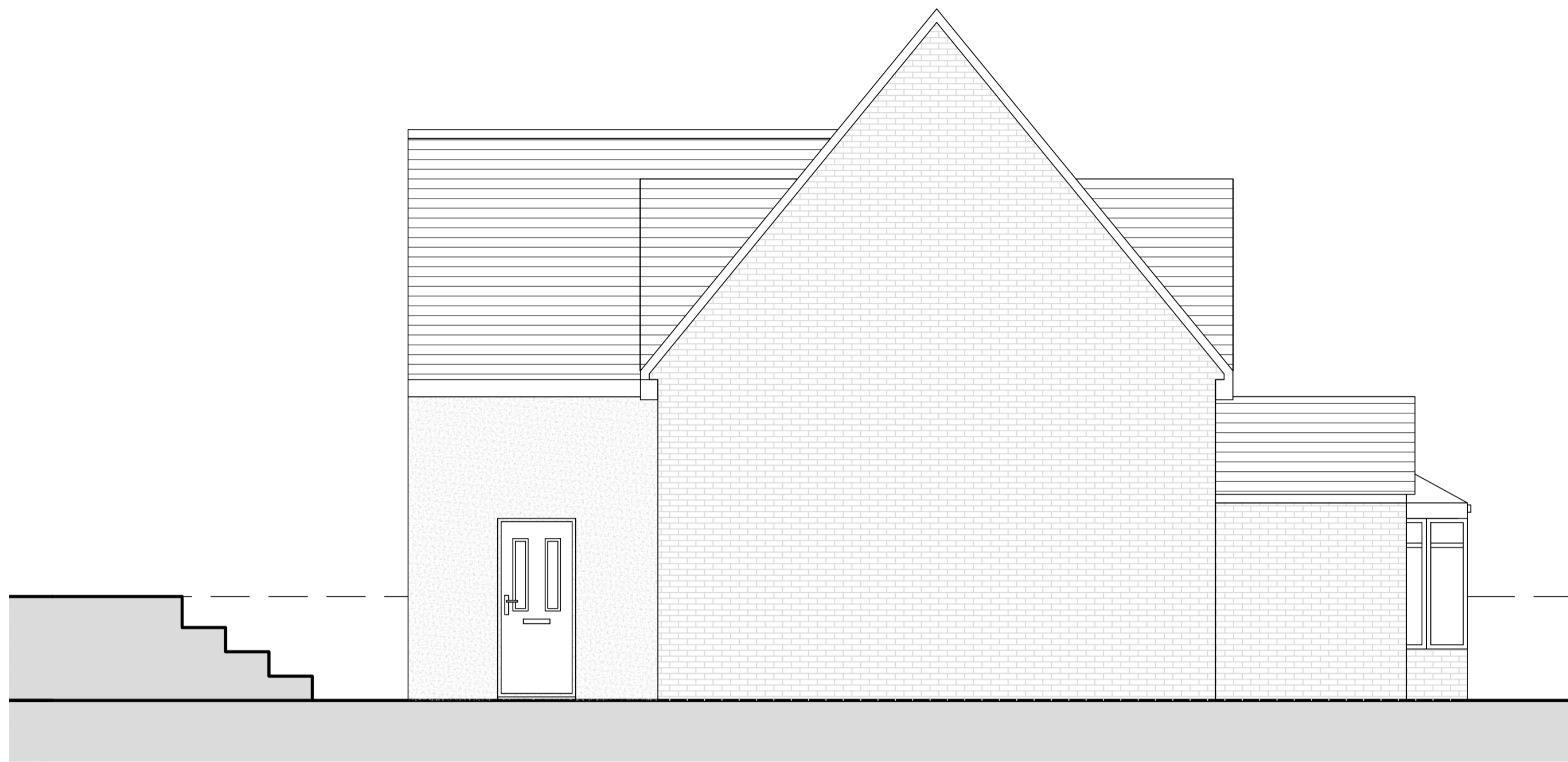
East Elevation as EXISTING 1:50