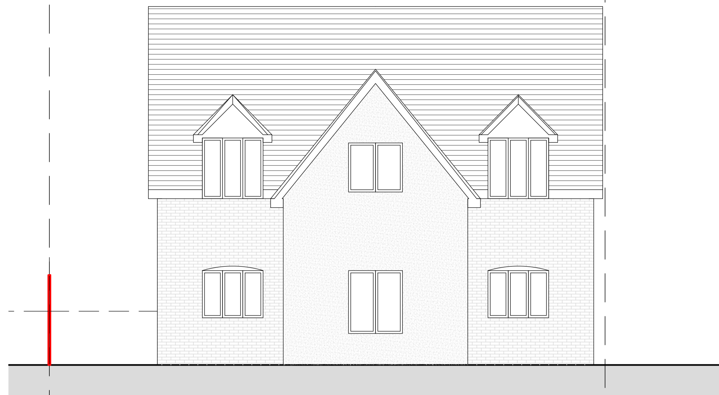
South Elevation as EXISTING 1:50