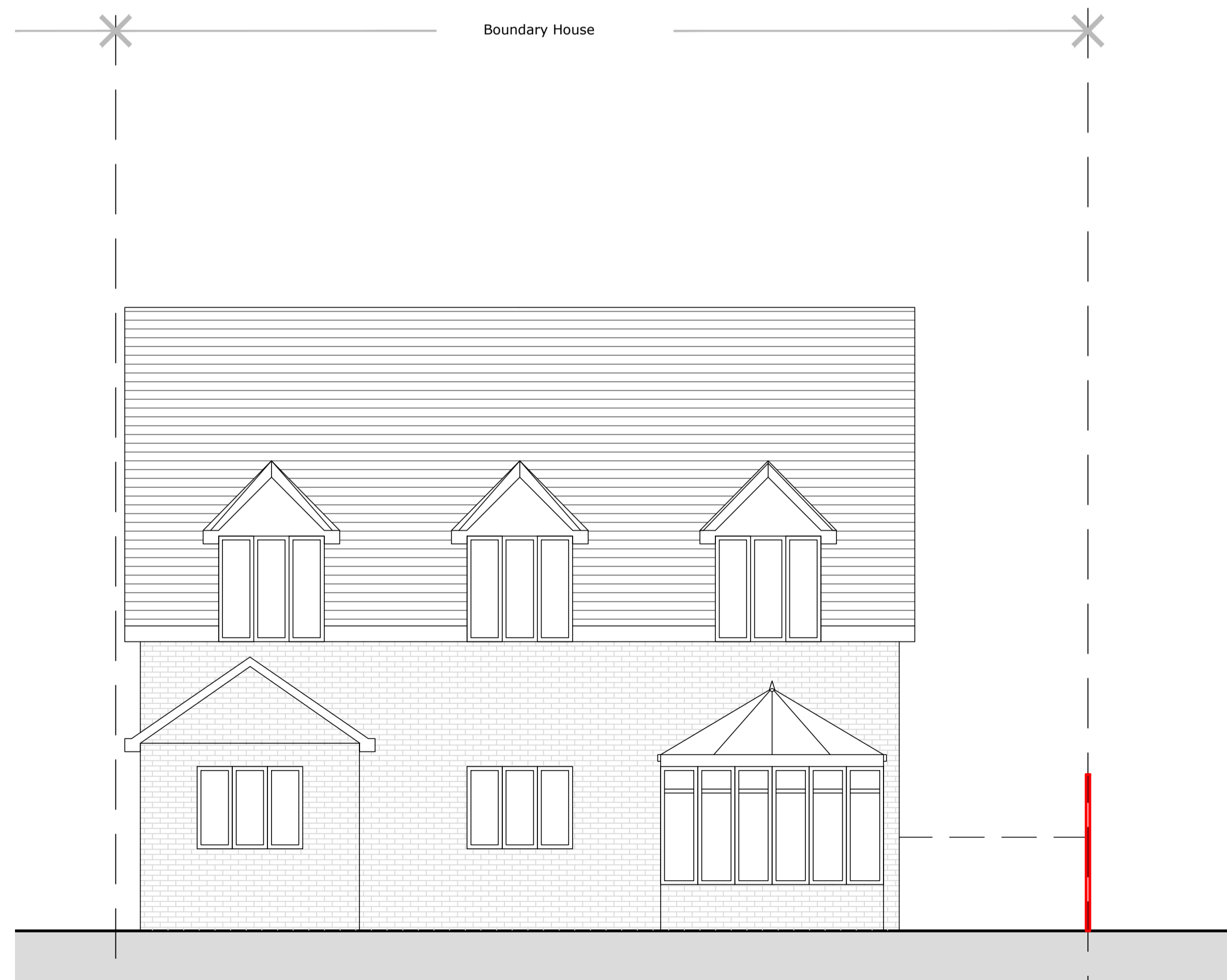
North Elevation as EXISTING 1:50