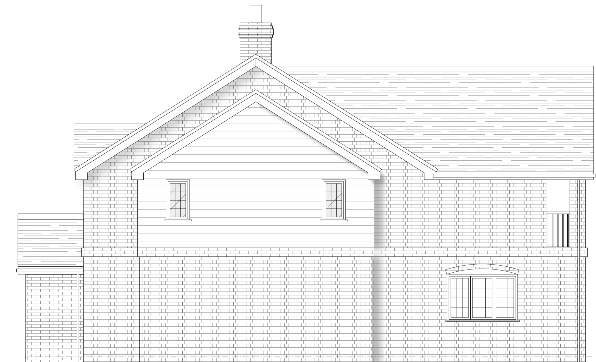
4 North Elevation Scale: 1:50