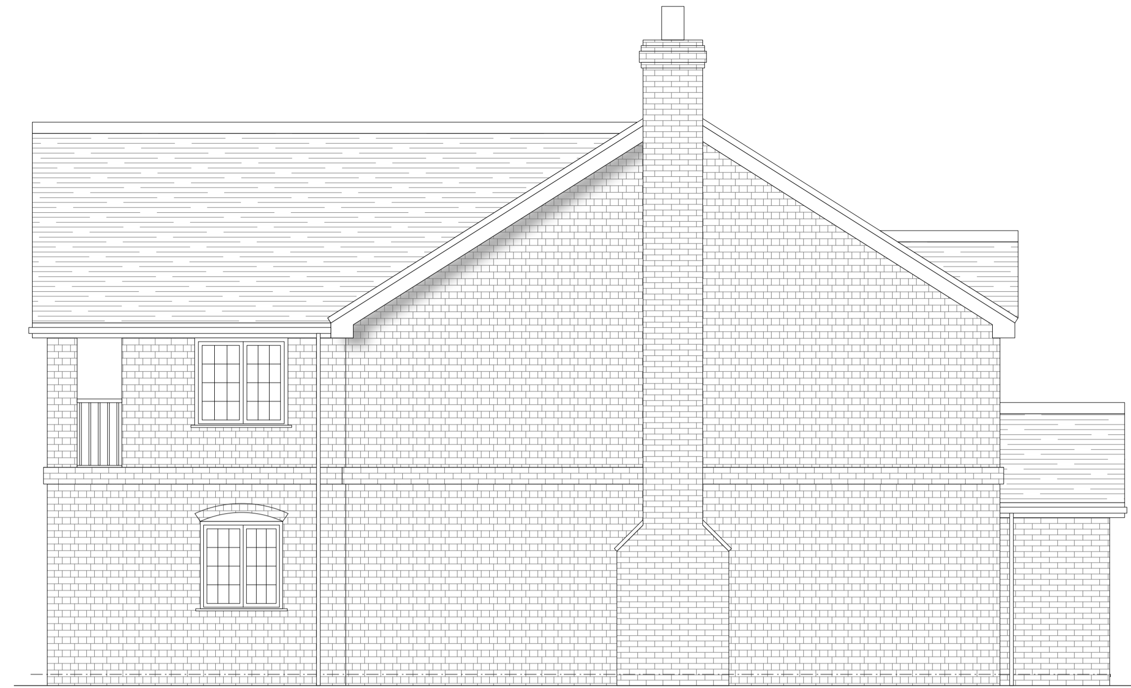
2 South Elevation Scale: 1:50

General Notes 1. Brick Arched Header Course to Fenestration Raised Brick Detail Course Paint Finished Timber Double Glazed Windows & Doors Natural Timber Vertical Cladding