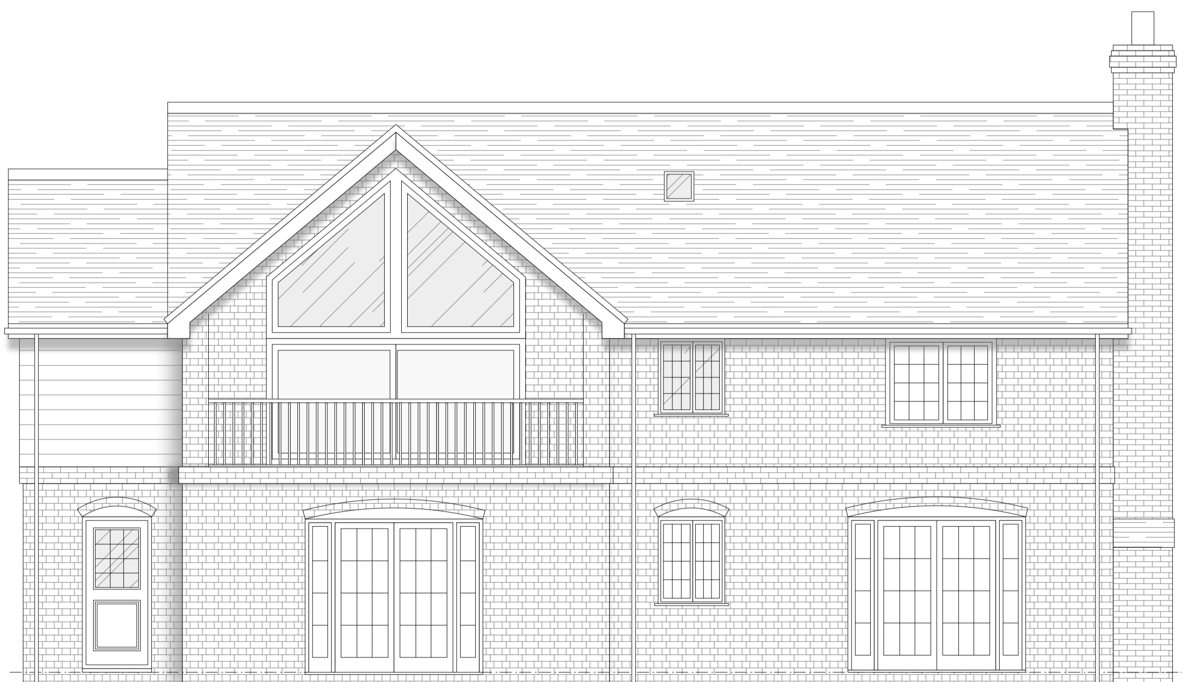
3 West Elevation Scale: 1:50

General Notes 1. Brick Arched Header Course to Fenestration Raised Brick Detail Course Paint Finished Timber Double Glazed Windows & Doors Natural Timber Vertical Cladding