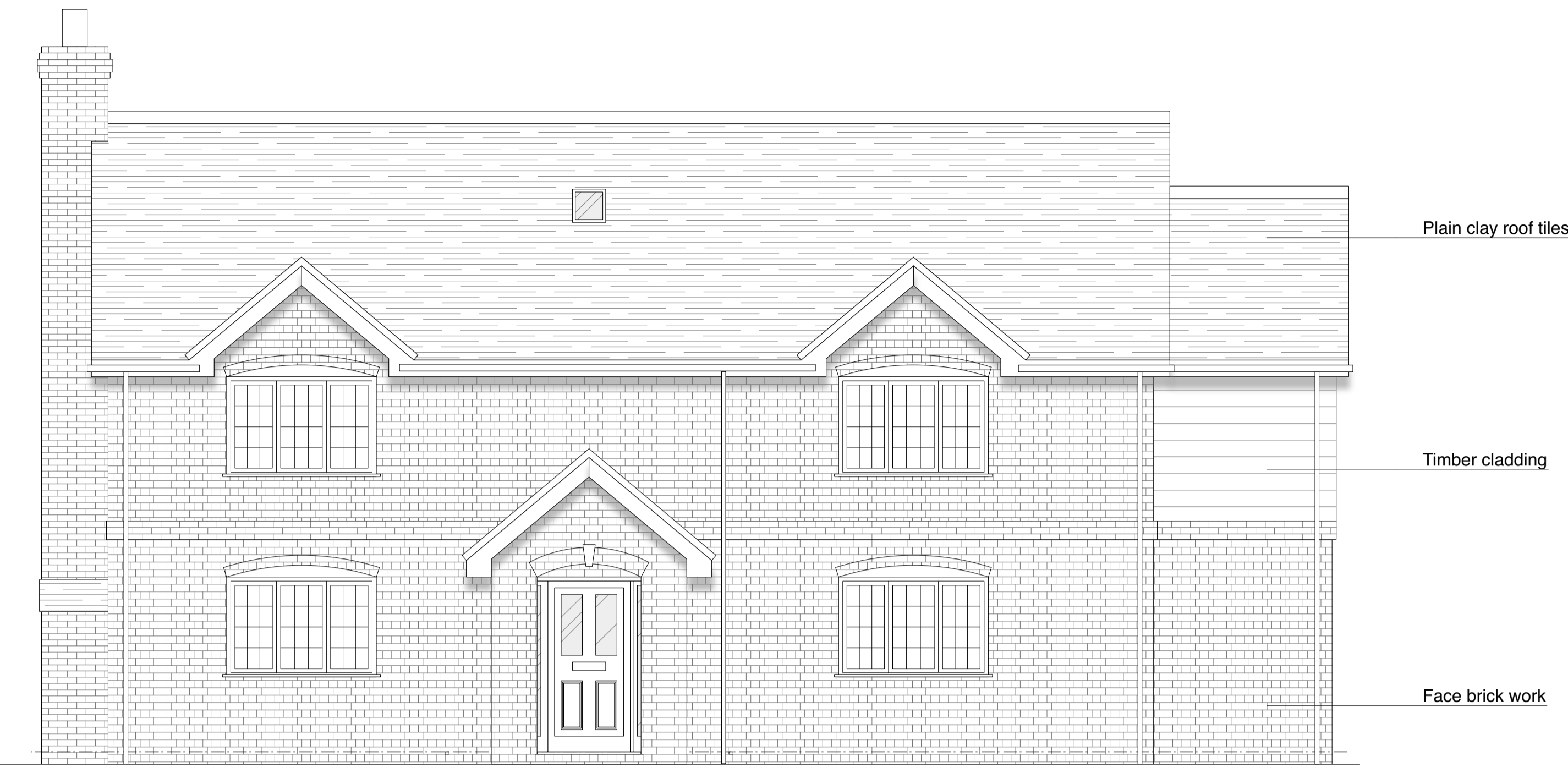
1 East Elevation Scale: 1:50

General Notes 1. This drawing is the copyright of Peter Tesar Architectural Design Ltd and must not be used, edited or reproduced without permission. 2. Inaccessible areas for site measure & survey have been assumed