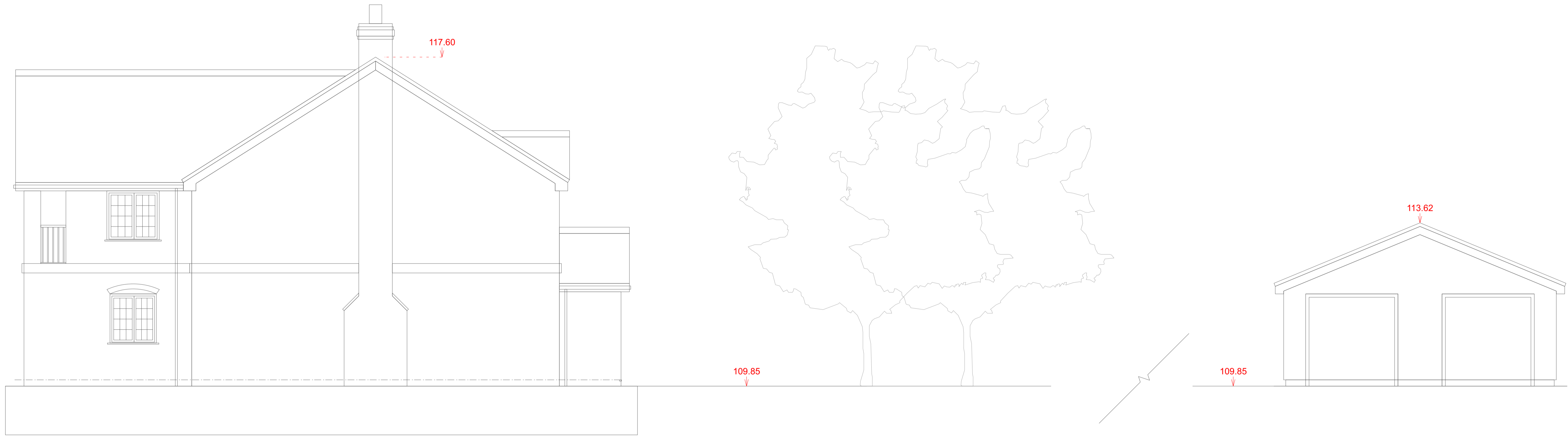
1 Land Section Detail Scale: 1:50