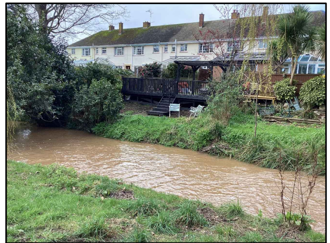
view of deck looking west