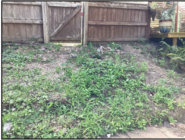
view looking west prior to deck