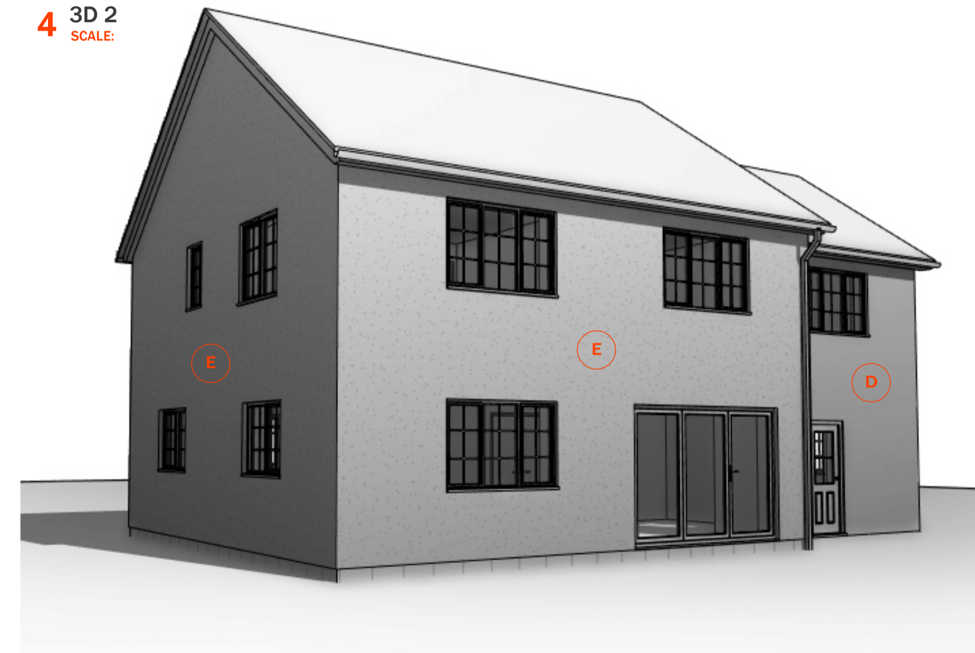
4 3D 2 SCALE:

Responsibility is not accepted for errors made by others in scaling from this drawing. All construction information should be taken from figured dimensions only.