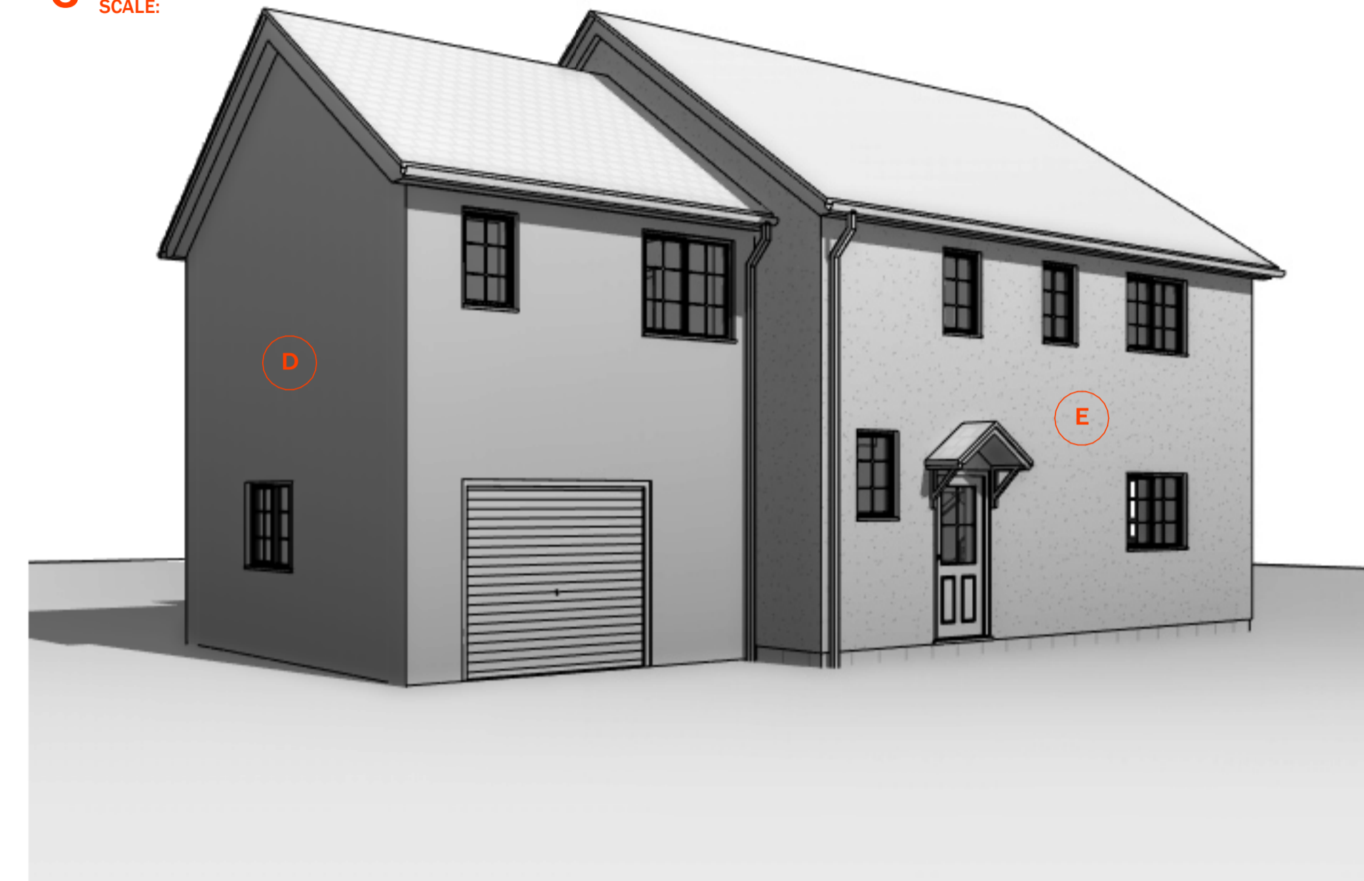
3 3D 1 SCALE: