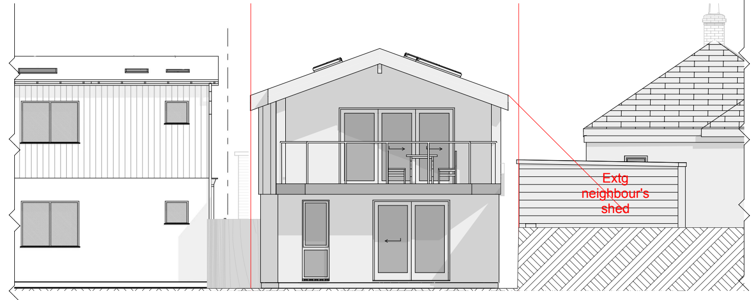
3 NORTH ELEVATION 1:100