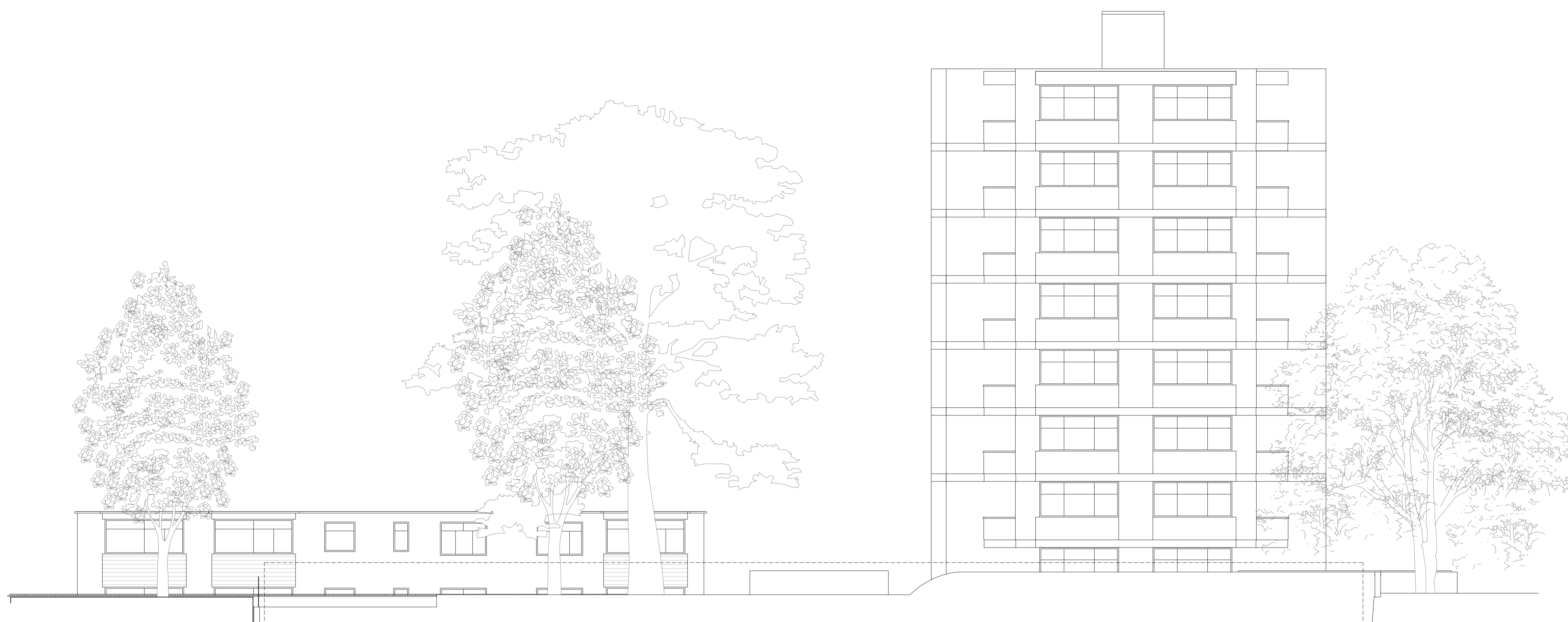
East Site Elevation 1:100