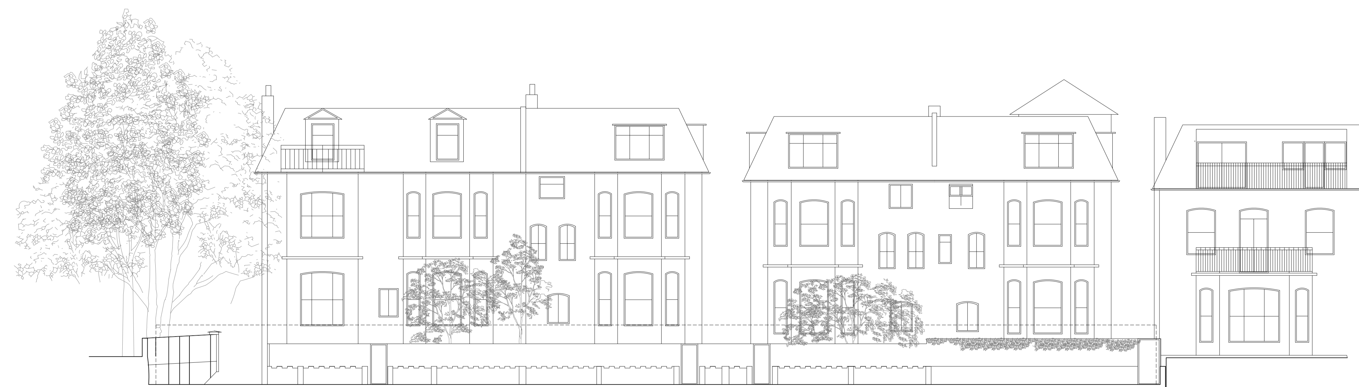
West Site Elevation 1:100