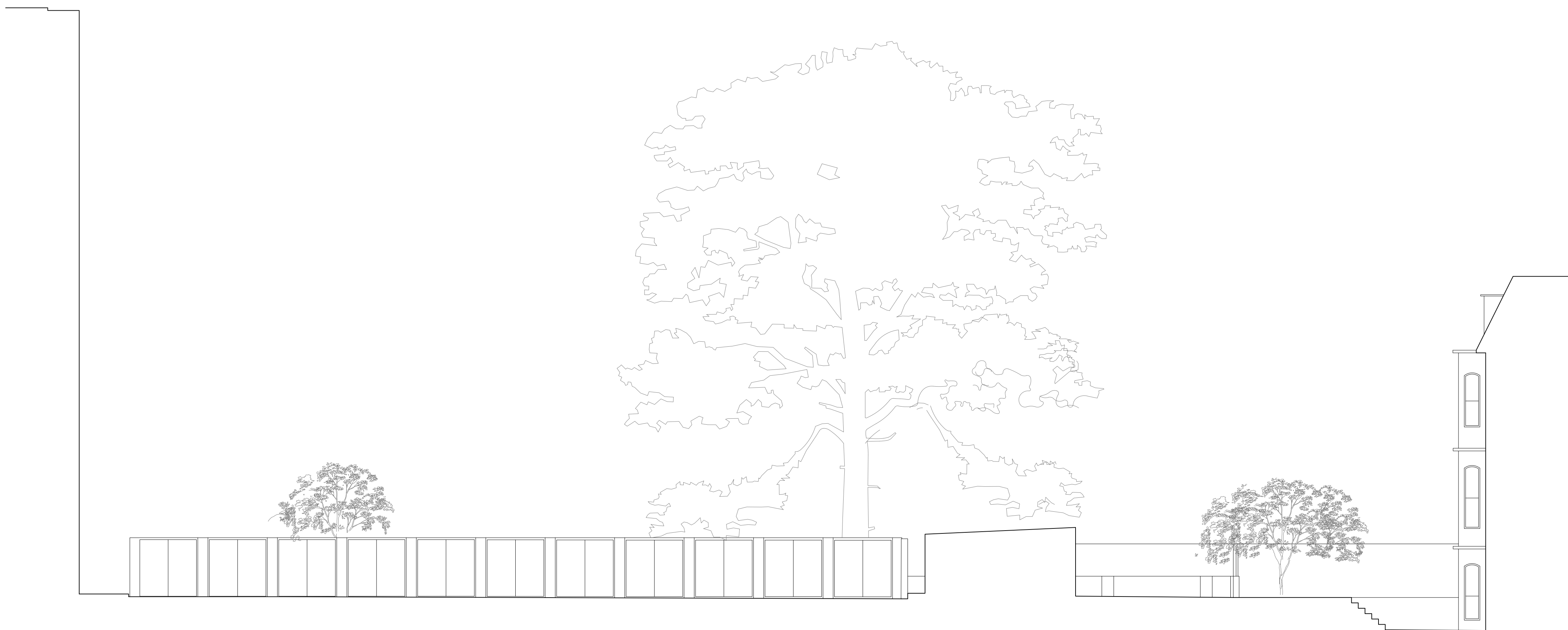
South Sectional Site Elevation 2 (SE2) 1:100