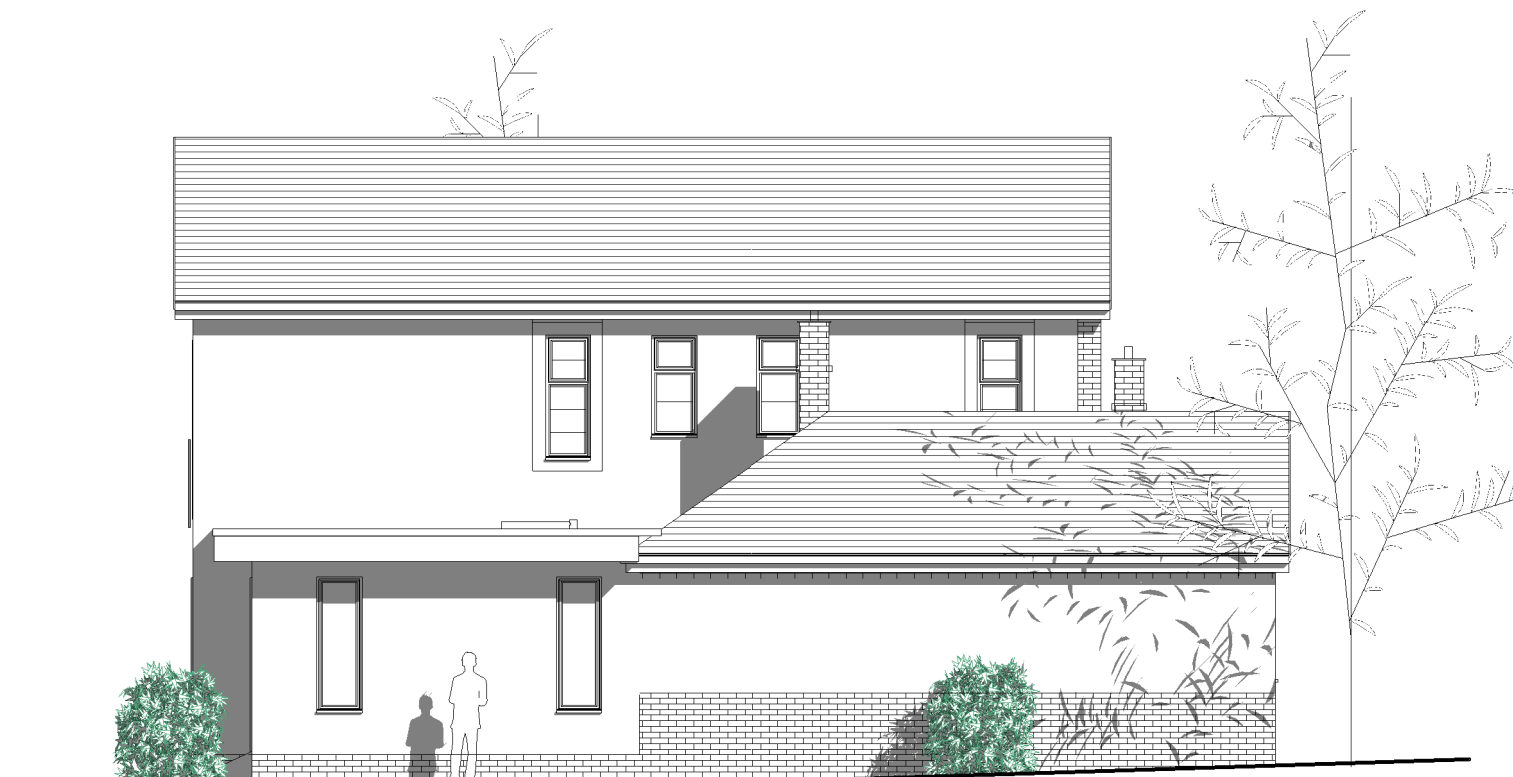
5 Side Elevation 1 1 : 100

Copyright of this drawing is vested in the Designer and it must not be copied or reproduced without consent. Only figured dimensions are to be taken from this drawing. All contractors must visit the site and be responsible for taking and checking all dimensions relative to their work. Notify the Designer immediately of any variation between drawings and site conditions.