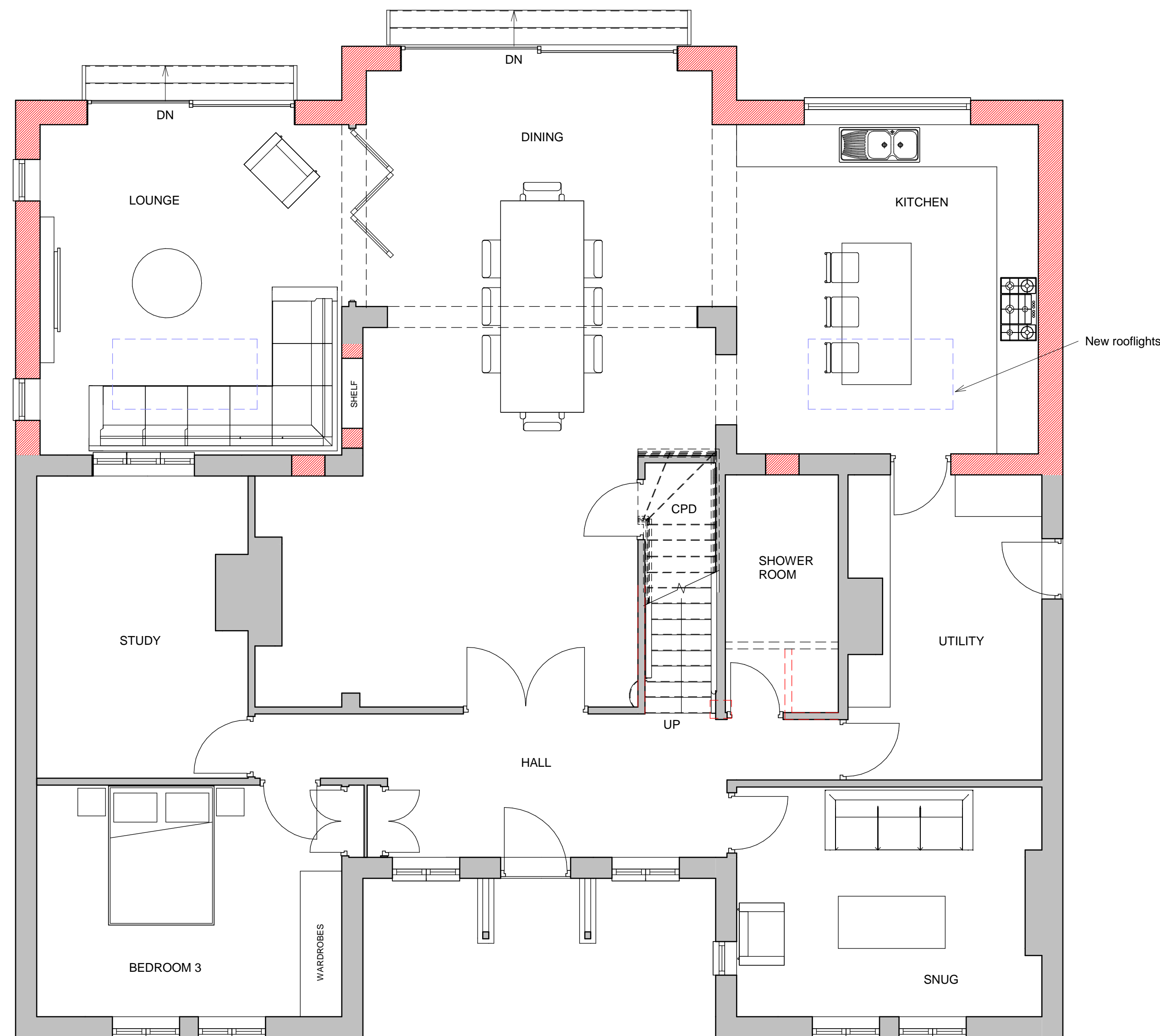
1 Ground Floor 1 : 50

It is assumed that all works on this drawing will be carried out by a competent contractor working, where appropriate, to an approved method statement.