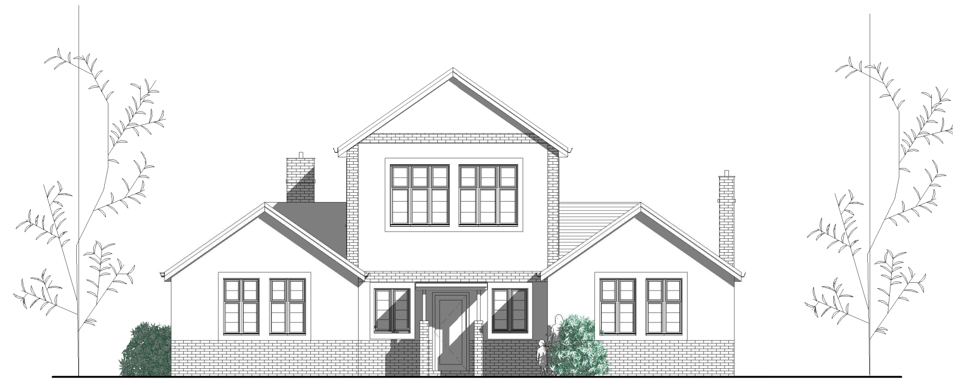
3 Front Elevation 1 : 100