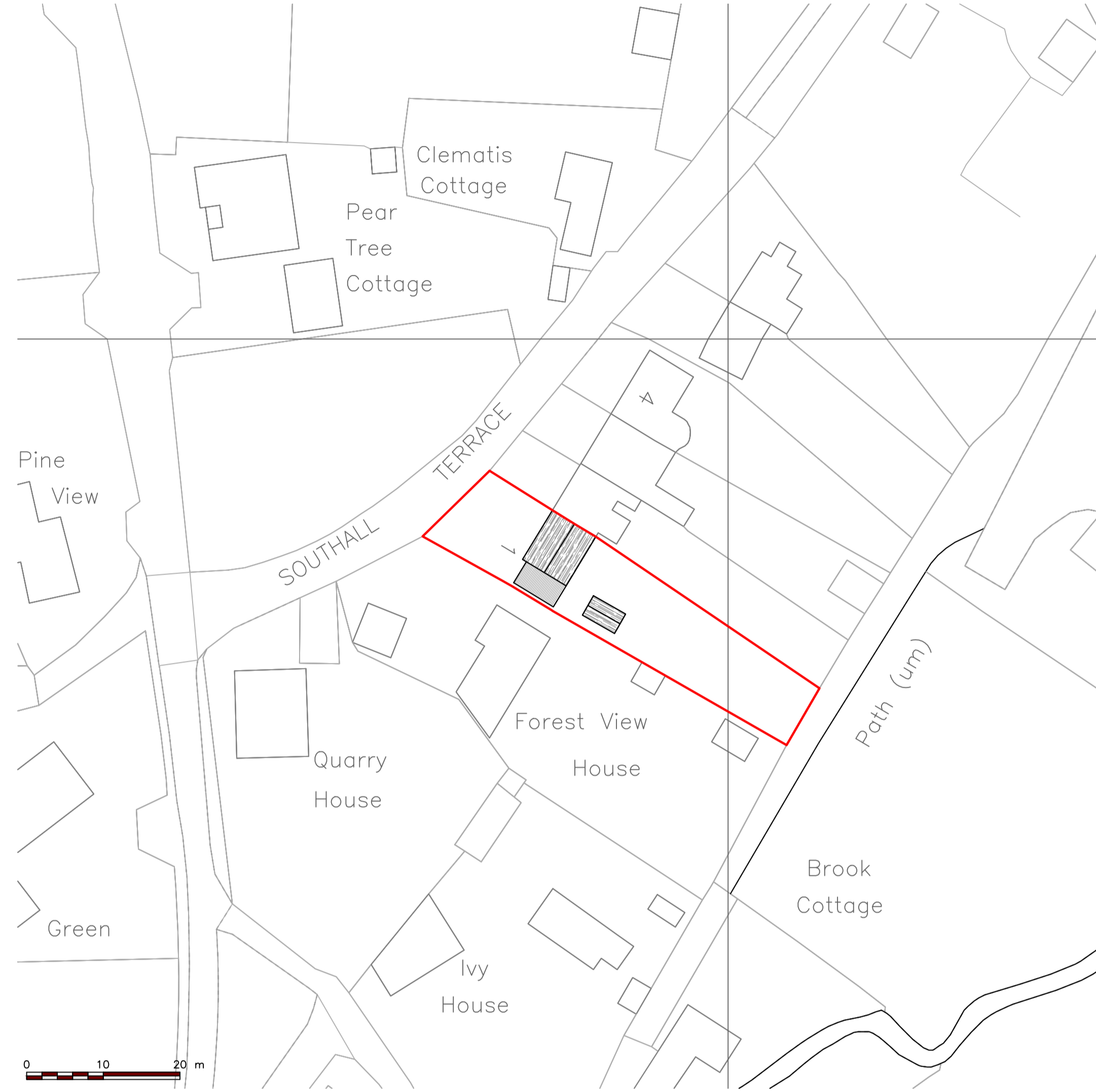
AS EXISTING BLOCK PLAN - 1:500