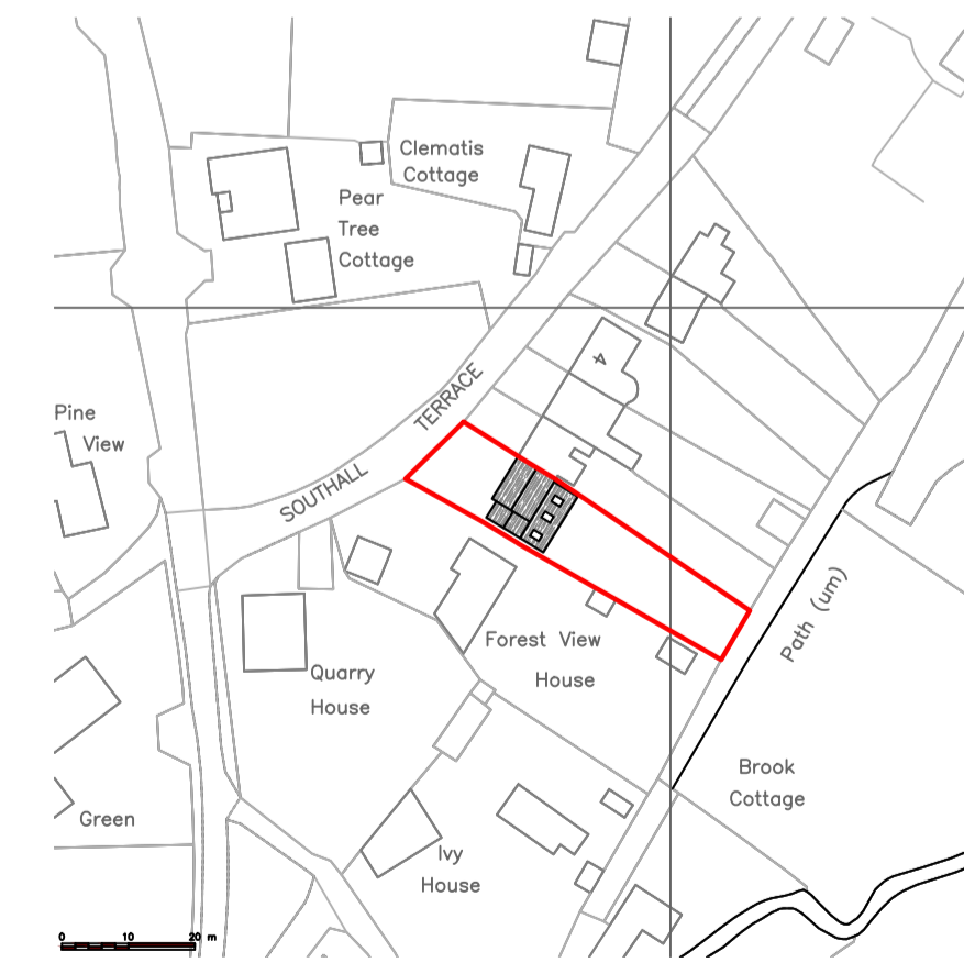
AS PROPOSED SITE PLAN - 1:1250