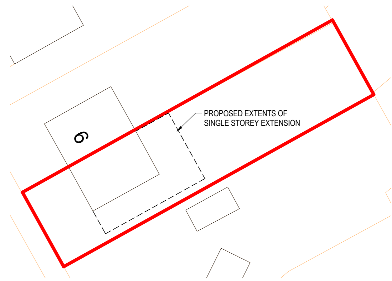
BLOCK PLAN 1 : 250