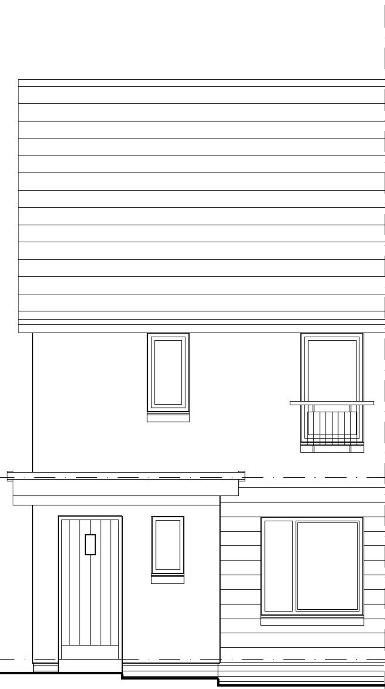
EAST ELEVATION 1:50