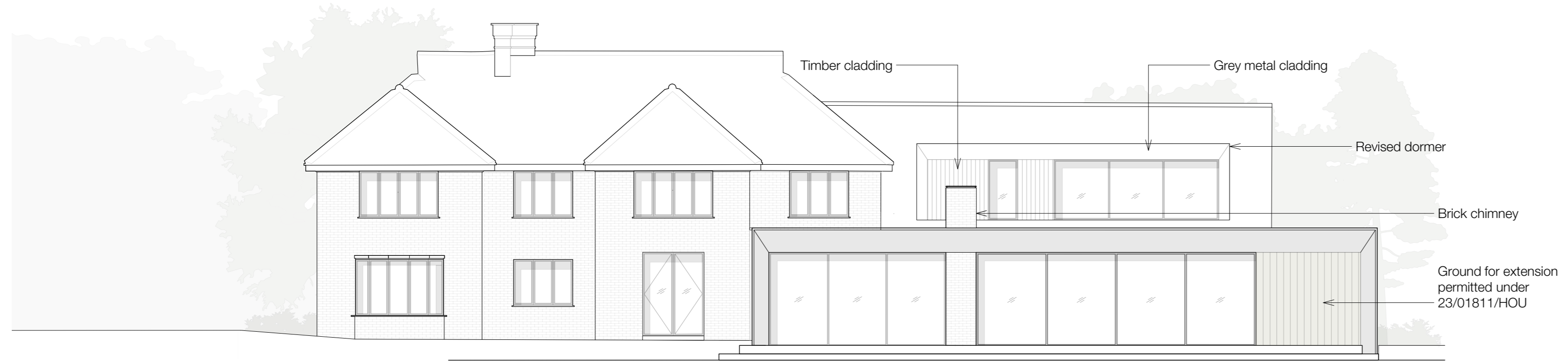
2 PROPOSED SOUTH EAST ELEVATION - As approved with proposed dormer amendments ref. 23/01811/HOU