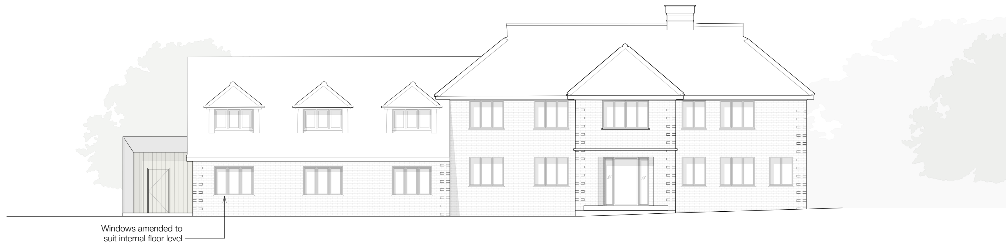
1 PROPOSED NORTH WEST ELEVATION - As approved with proposed window amendments ref. 23/01811/HOU