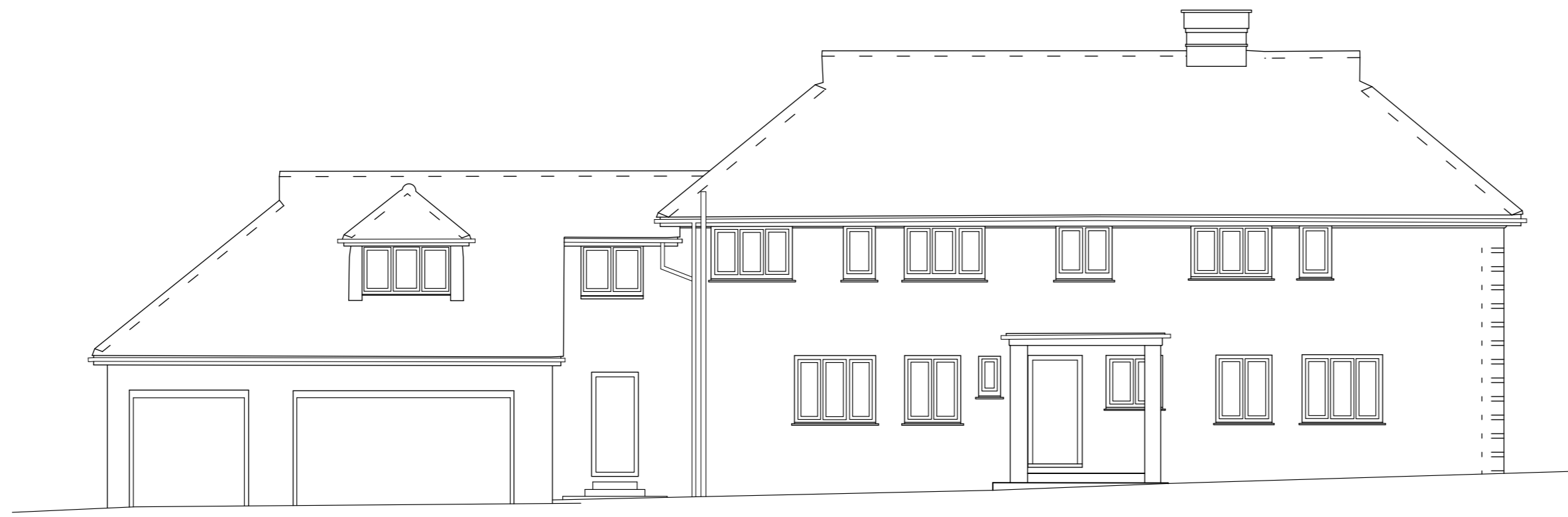
1 EXISTING NORTH WEST ELEVATION