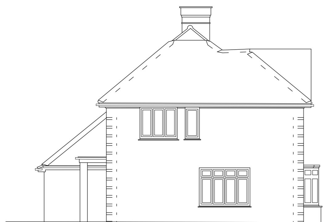
3 EXISTING SOUTH WEST ELEVATION