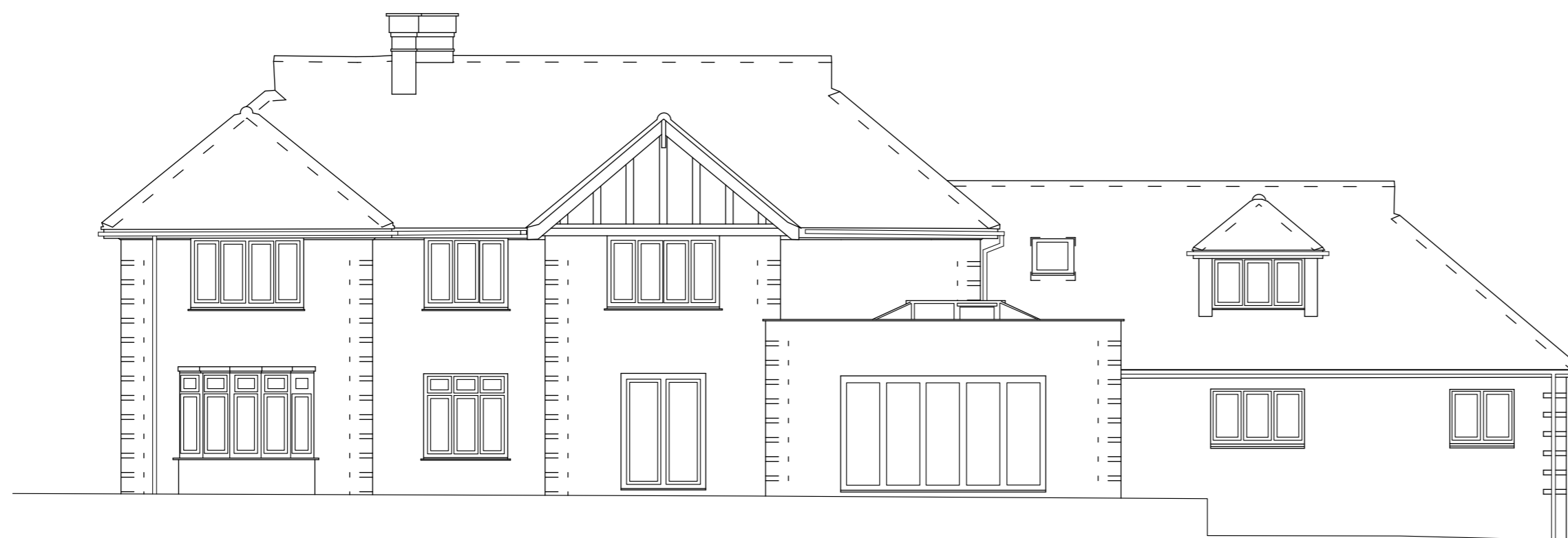
2 EXISTING SOUTH EAST ELEVATION