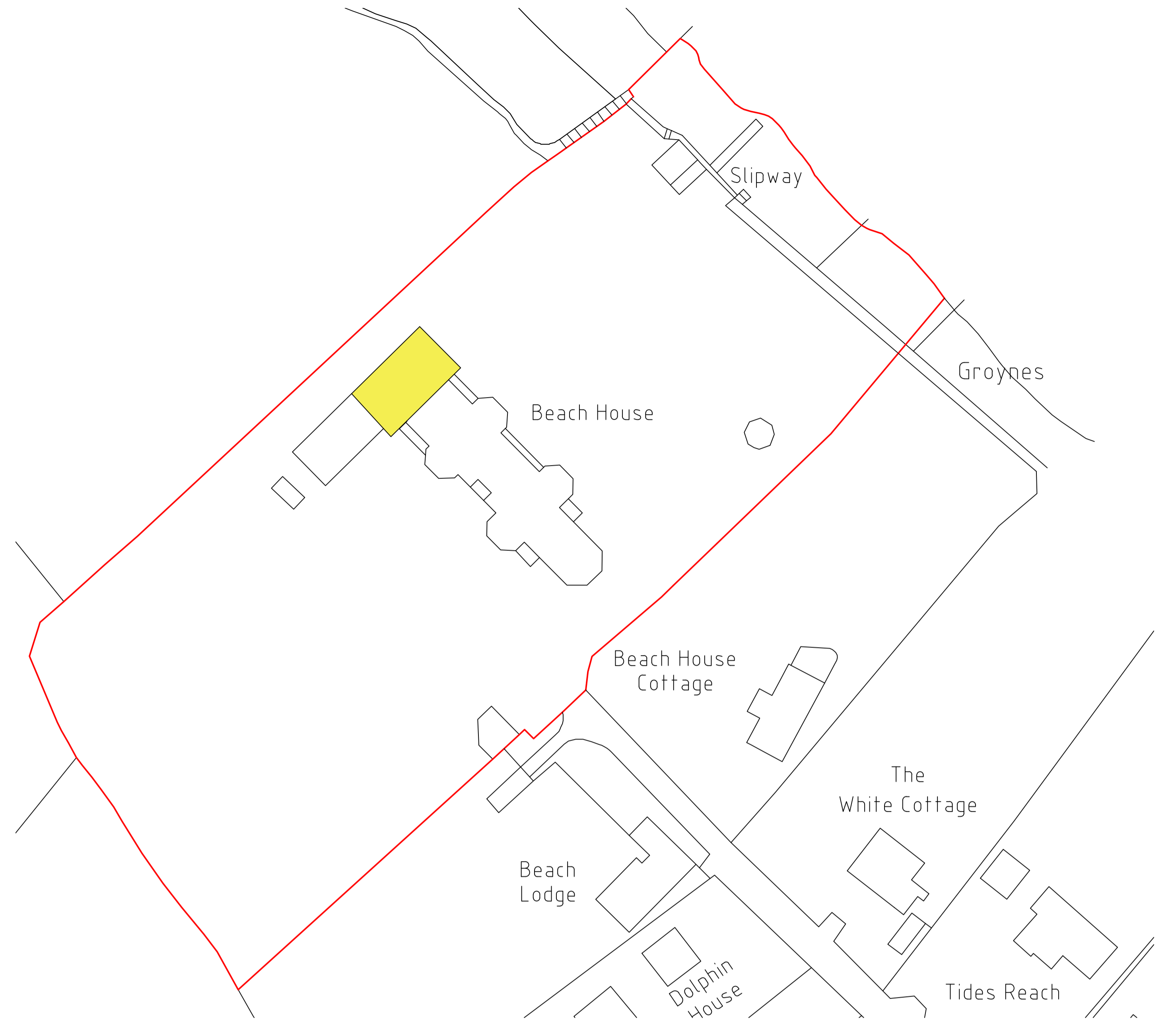
Proposed Block Plan Scale 1:500@ A1