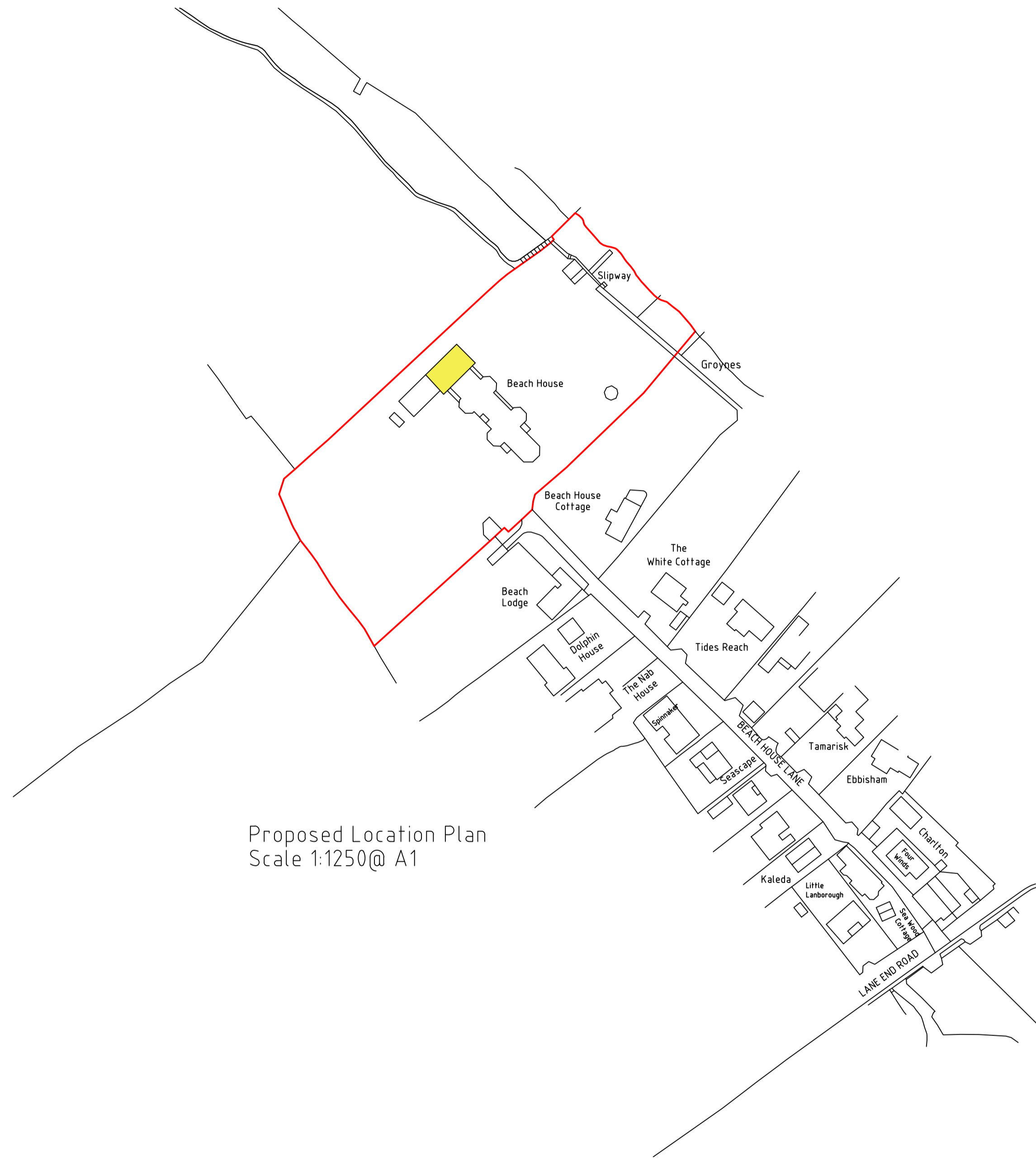
Proposed Location Plan Scale 1:1250@ A1