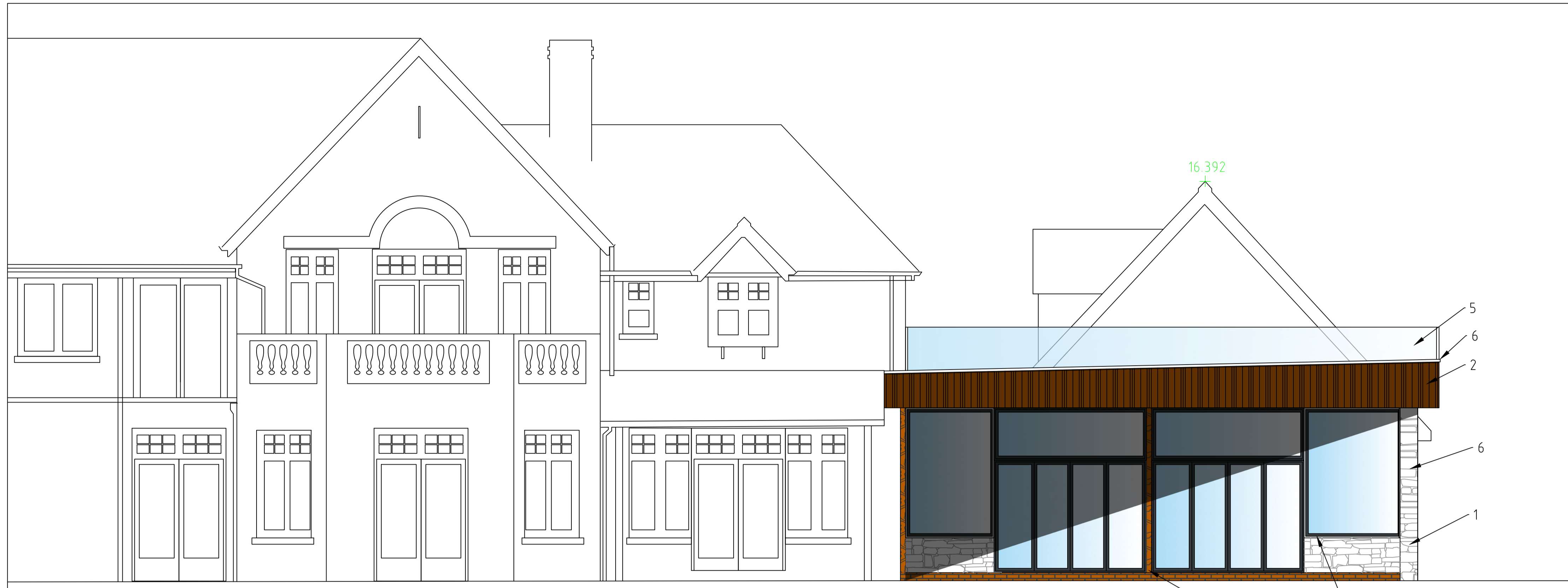
Proposed Part Rear Elevation Scale 1:50@ A1