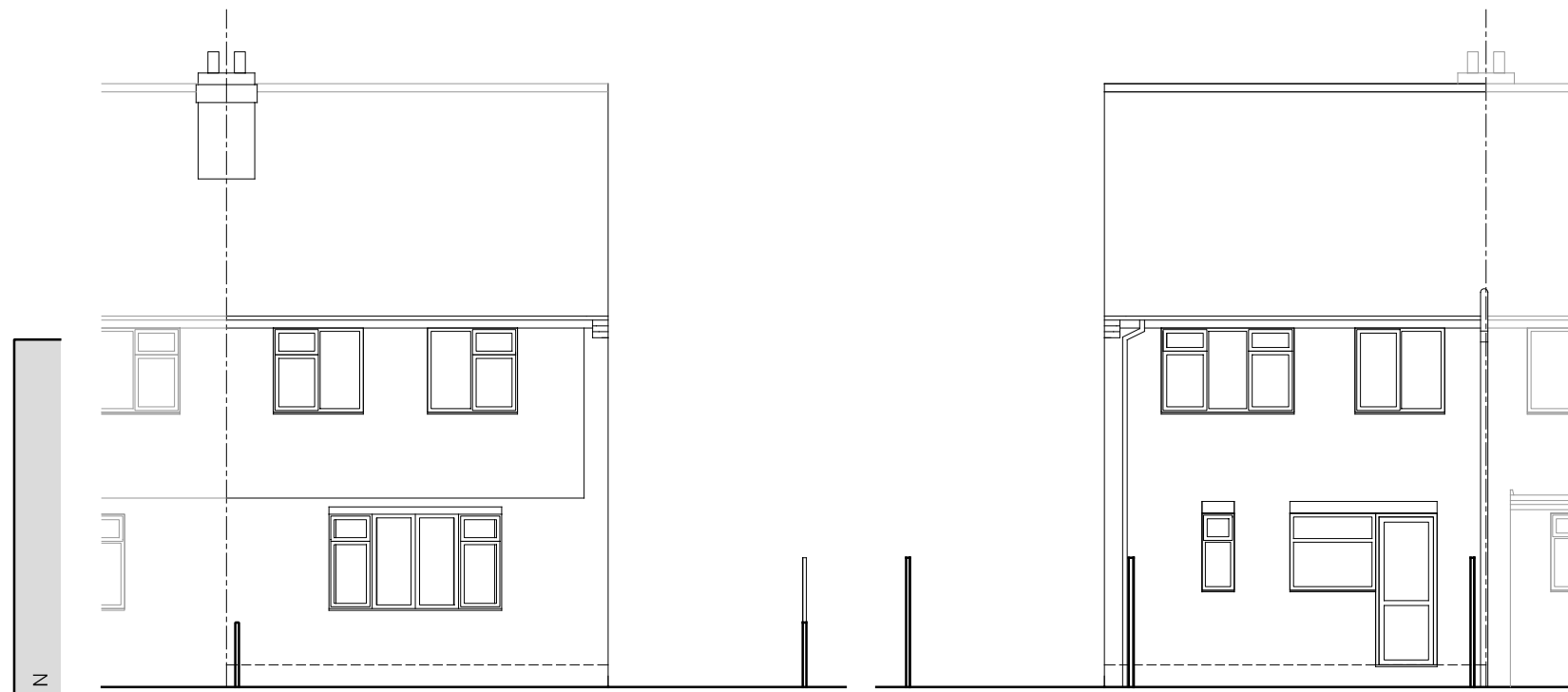
Existing North Elevation Scale 1:100