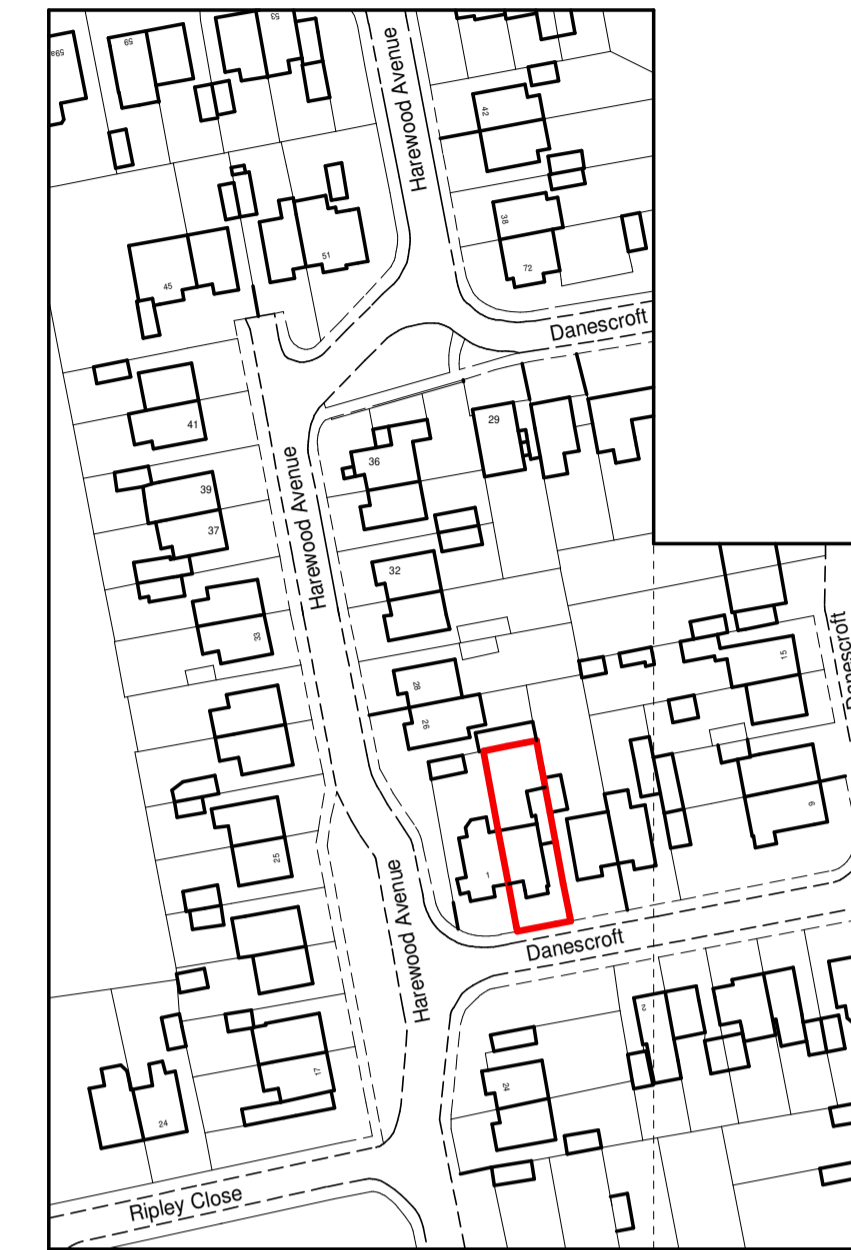
Site Location Plan (1:1250)