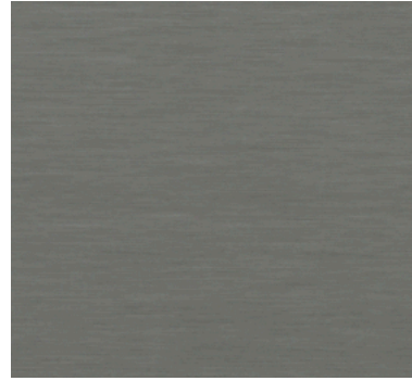
a Metal standing seam zinc roof - VM zinc 'PIGMENTO Grey' with matching rainwater goods