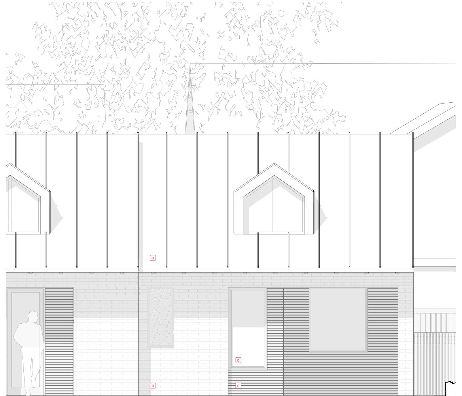
1:50 Elevation Extract