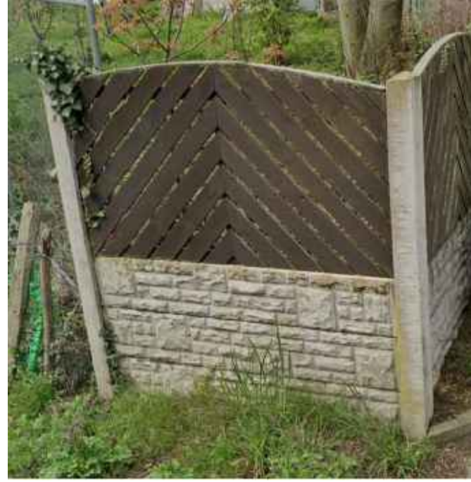
1.5m fence and gravel board