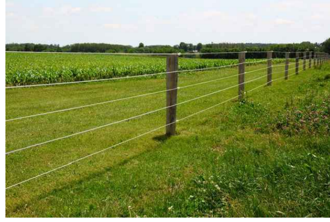
1.1m post and wire fencing to replace existing along boundaries