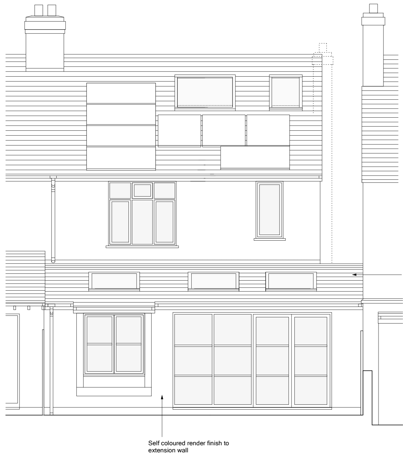
Proposed Rear Elevation Scale: 1:50 @ A2