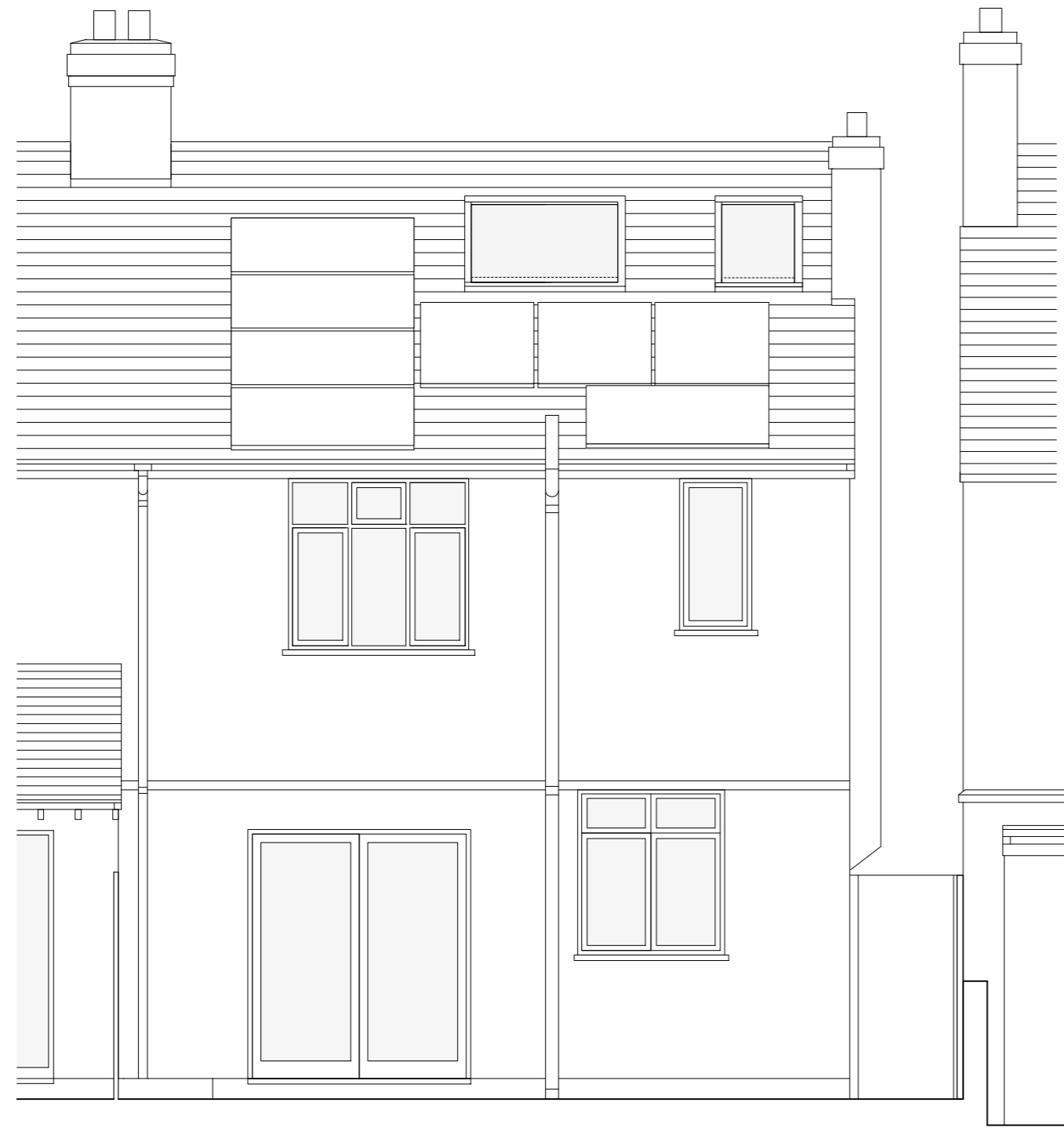
Existing Rear Elevation Scale: 1:50 @ A2