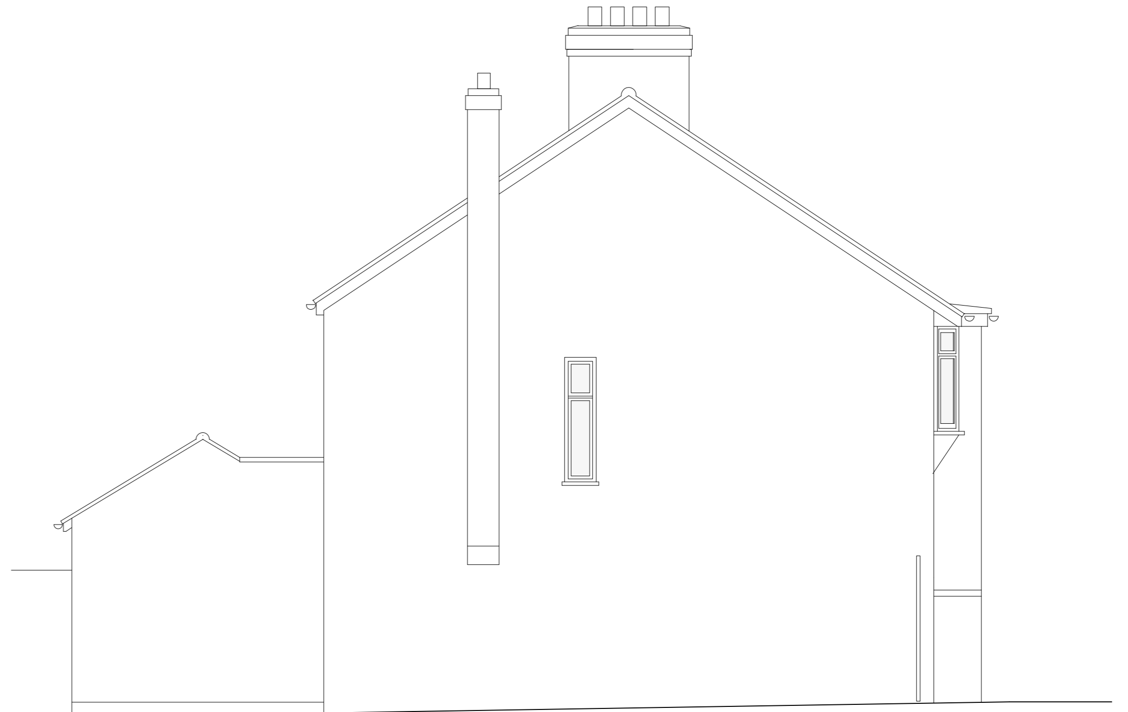
Existing Side Elevation Scale: 1:50 @ A2