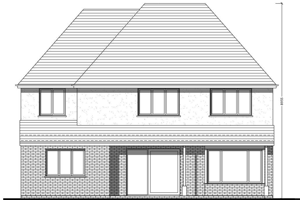
Front Elevation (West) - Proposed