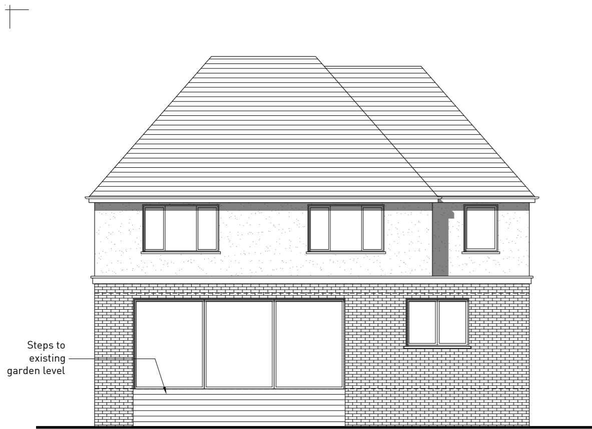
Rear Elevation (East) - Proposed