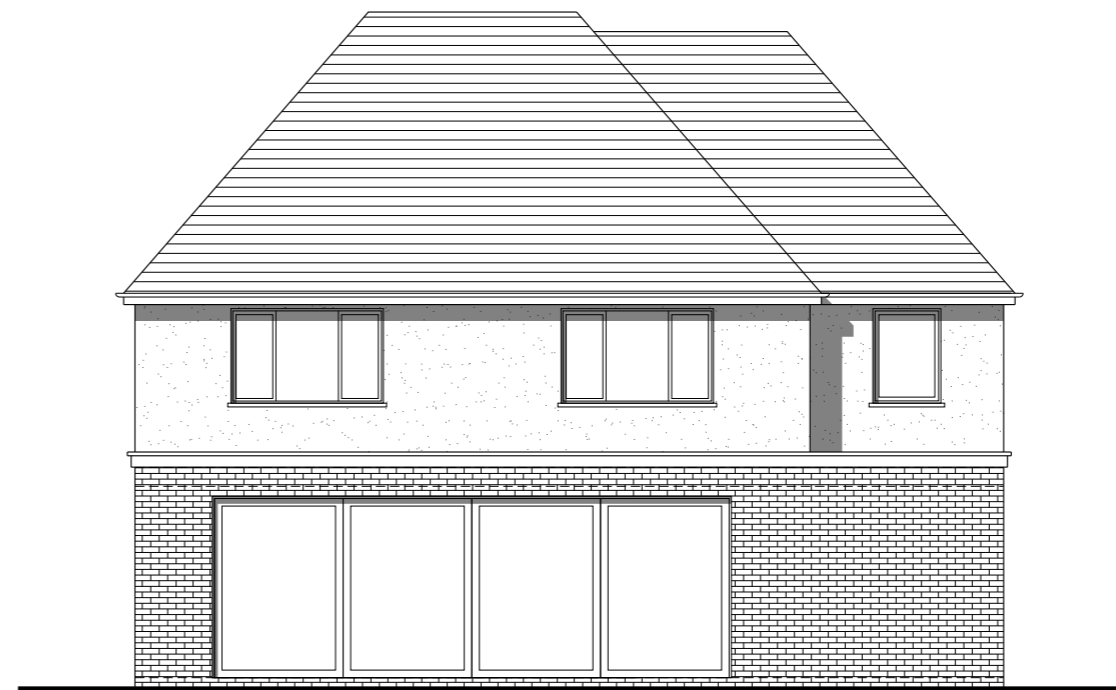
Rear Elevation (East) - As Consented (22/P/02128)