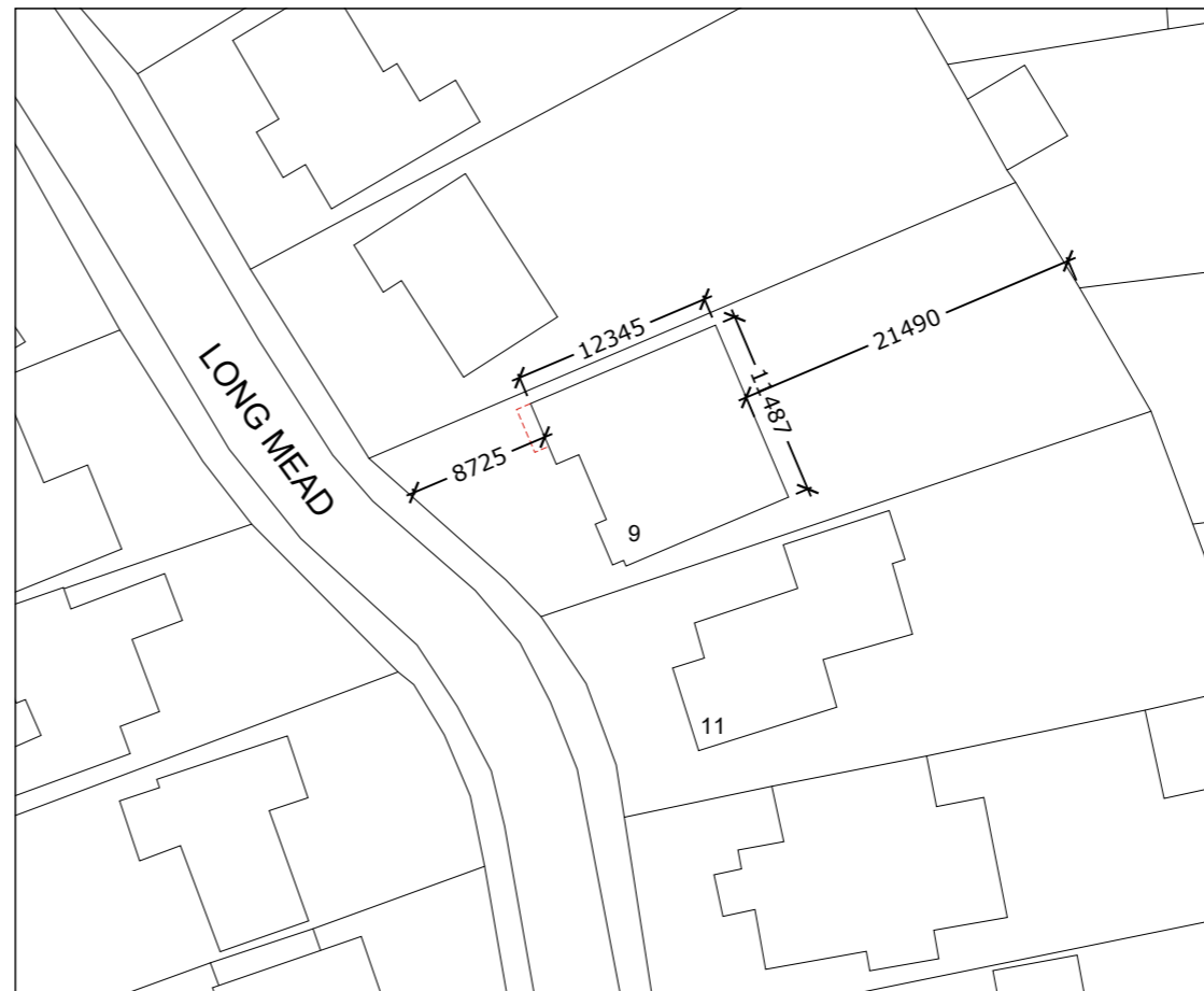
Block Plan Proposed Scale 1:500