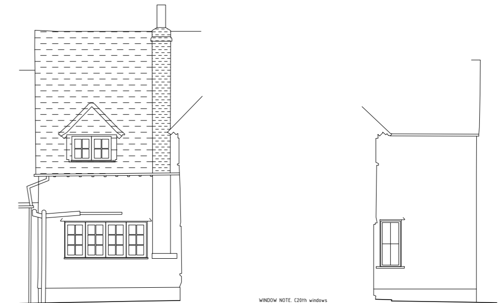
ELEVATION VIEW A-A

WINDOW NOTE: C20th windows have a live estrap LBC permission UTT/2009/0018 (as part of built out rear extension) to be single glazed timber flush casements on the old (pre 1948) house with cross integral glazing bars. There were no window conditions that needed discharging.