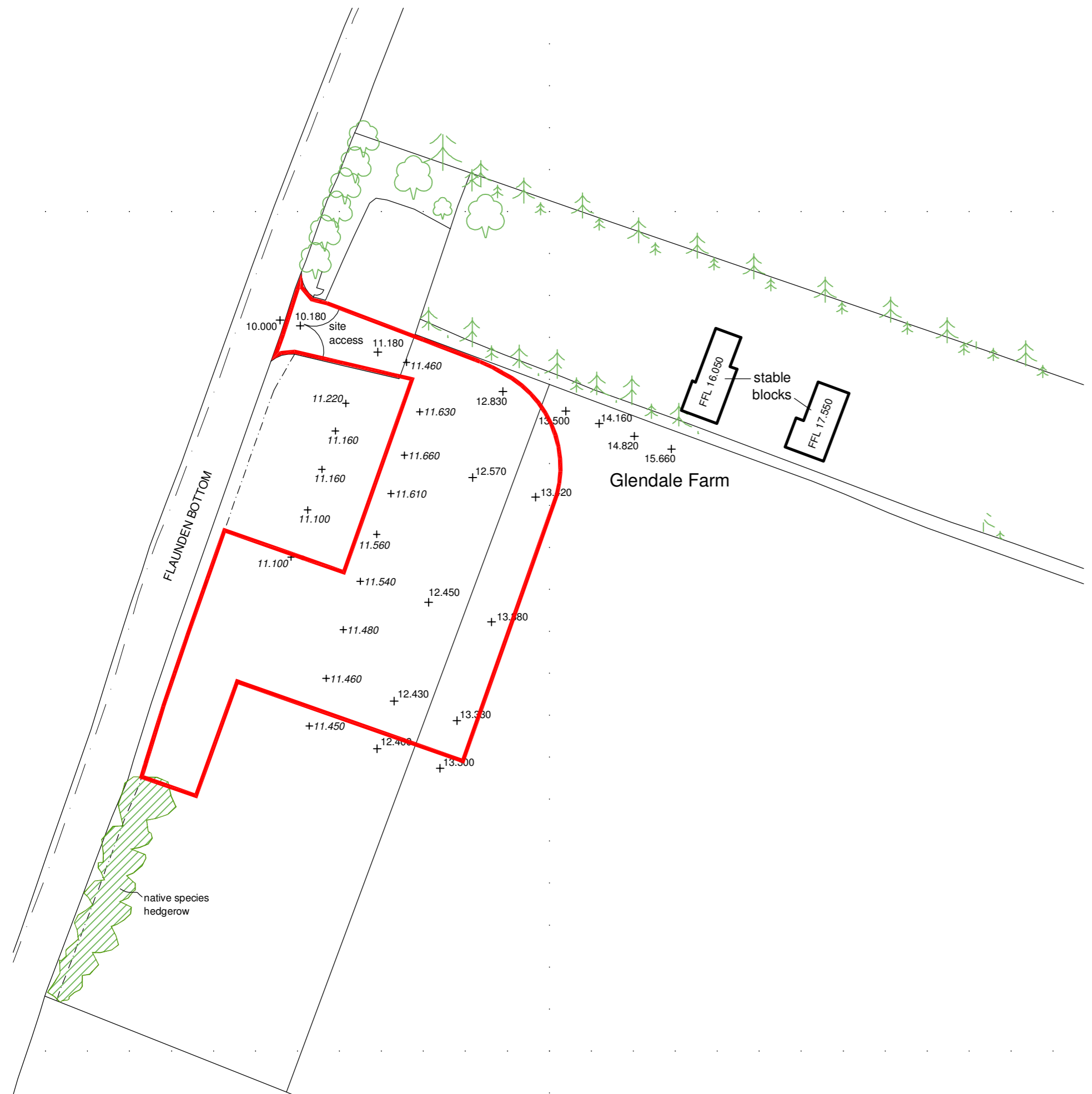
EXISTING SITE BLOCK PLAN