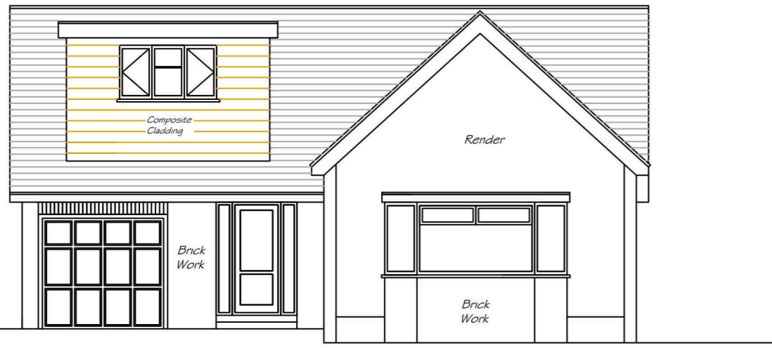
PROPOSED FRONT ELEVATION A.