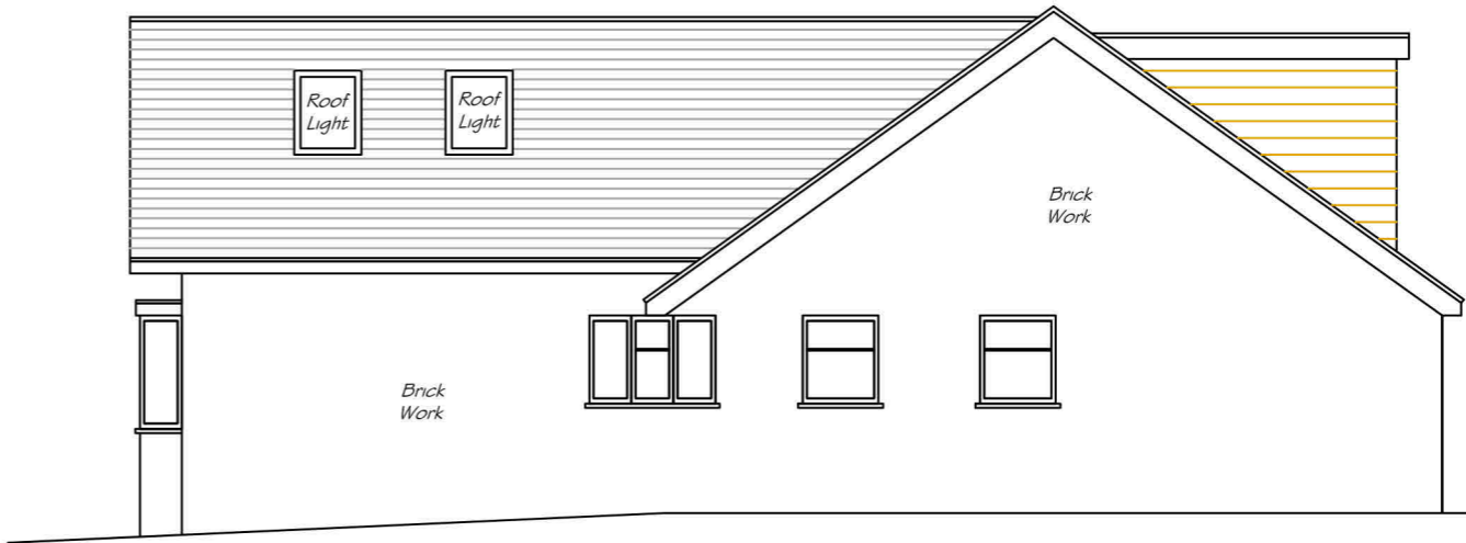
PROPOSED SIDE ELEVATION A.