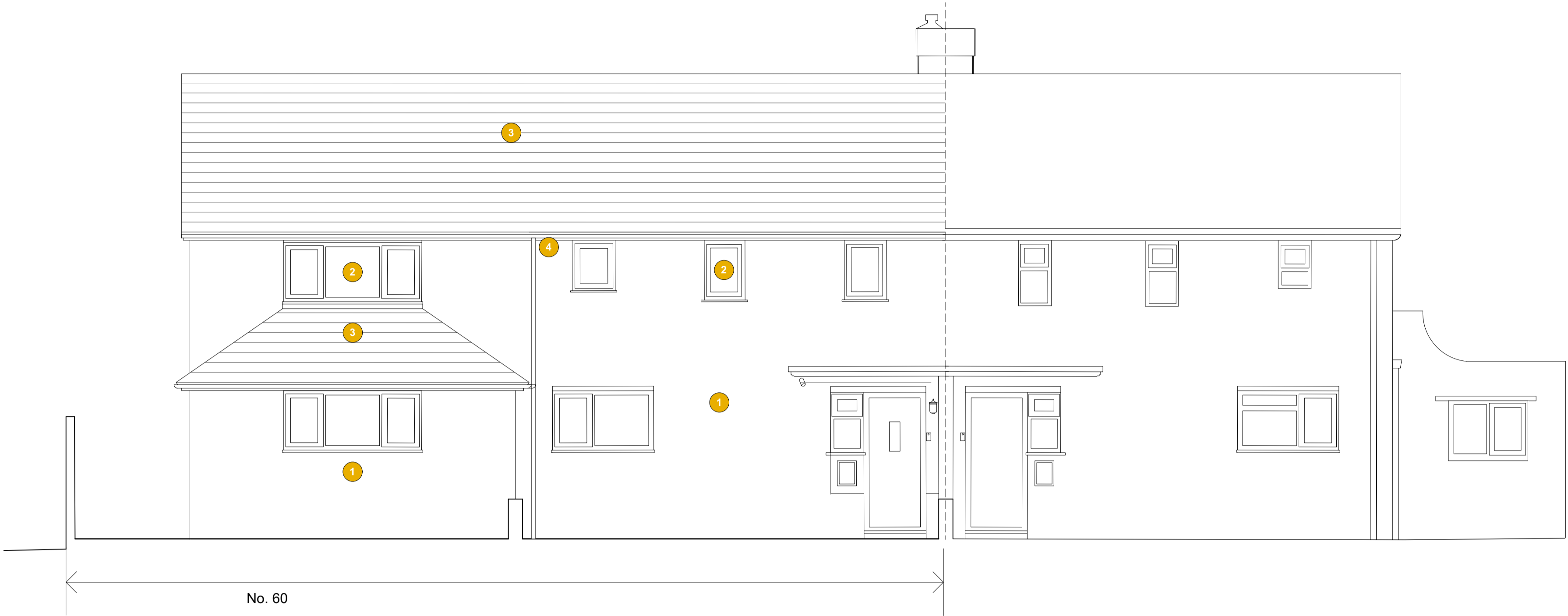
FRONT ELEVATION Scale: 1:50