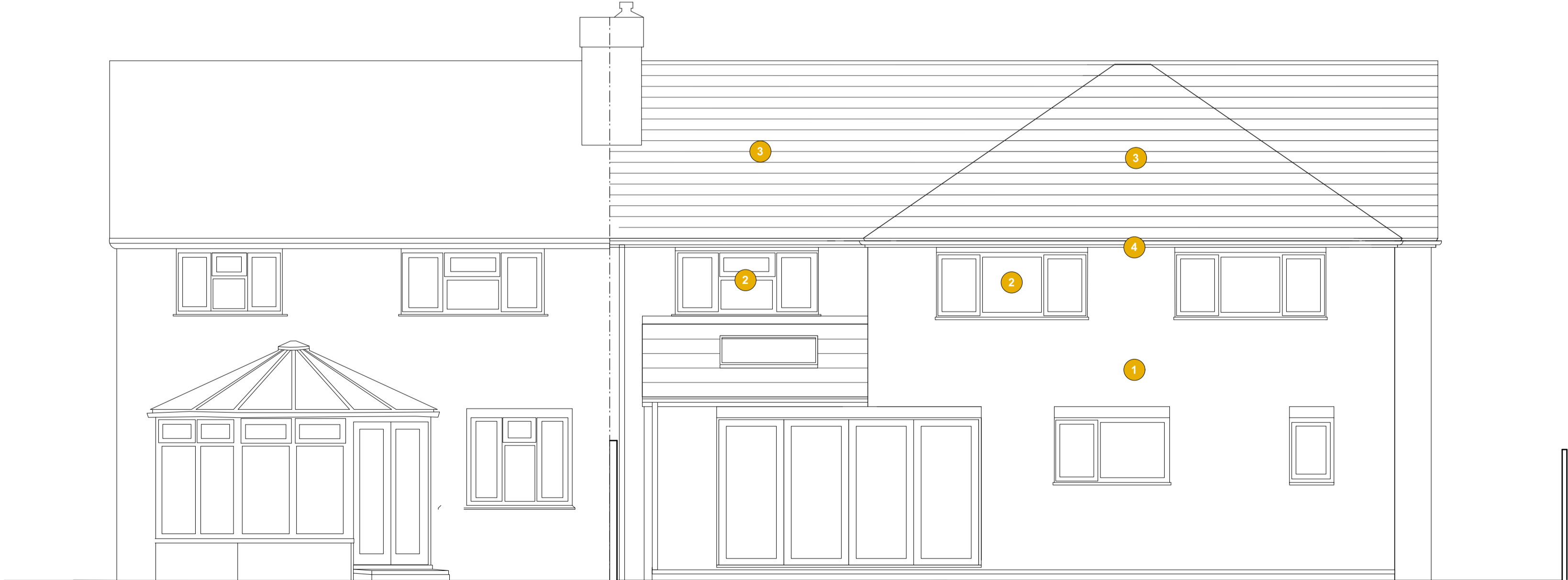
No. 60 REAR ELEVATION Scale: 1:50