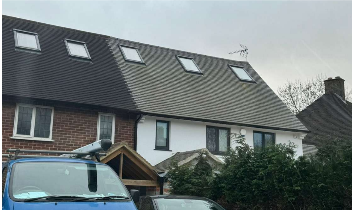
Built examples of proprietary self coloured white render finishes and Anthracite Grey fenestration in the locality that have informed the proposed.