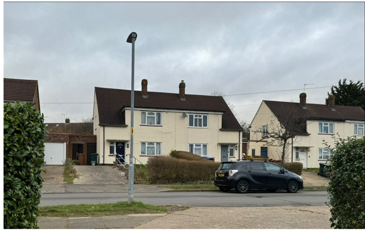
Built examples of render finished facades in Chiltern Drive opposite the site