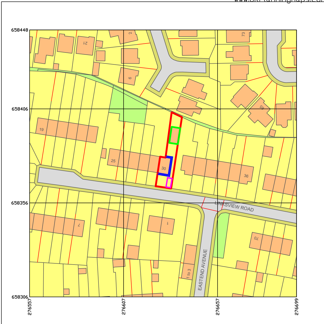
Location plan Scale: 1:1000

Important Do not scale from this drawing. Any discrepancies to be reported to the Contract Administrator.