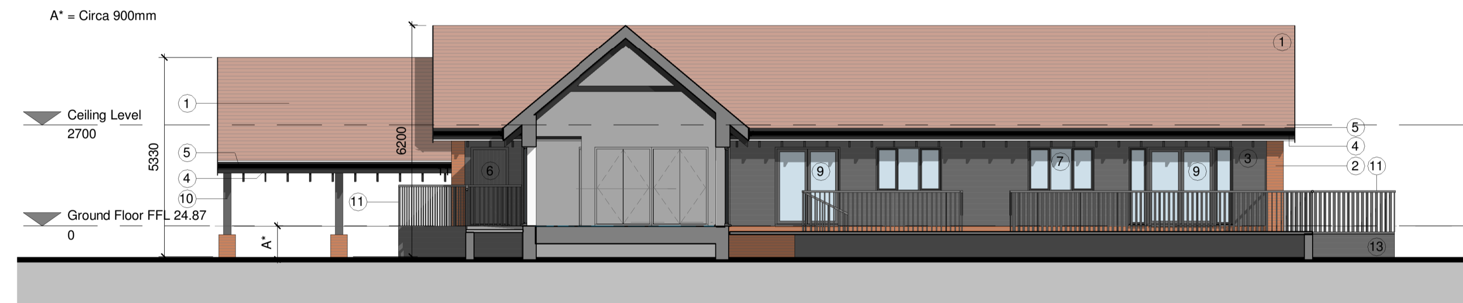
5 Cross section/ Elevation 5 - (Courtyard) Scale: 1 : 100