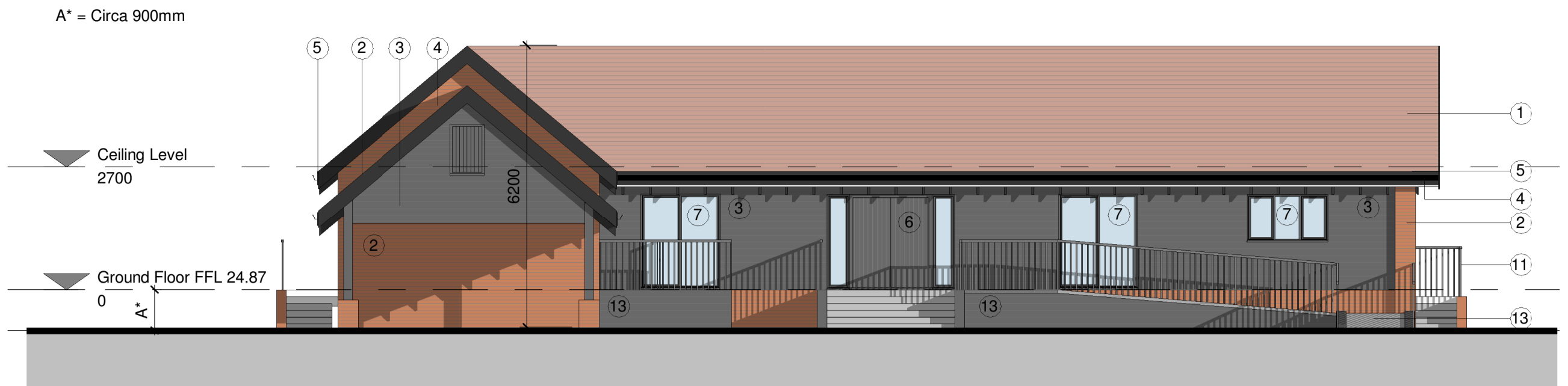
2 Elevation 2 - (West Facing) Scale: 1 : 100