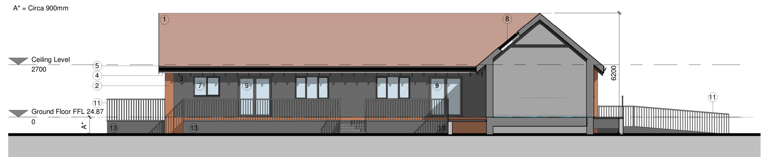
6 Cross section/Elevation 6 (Courtyard) Scale: 1 : 100