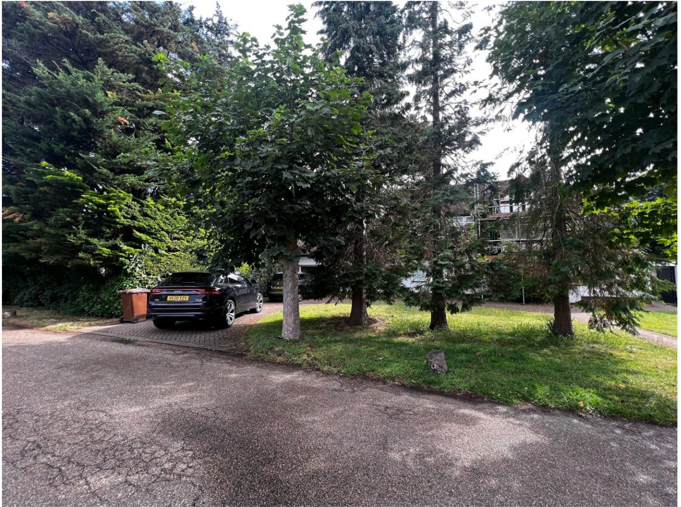
Roadside entrance to driveway