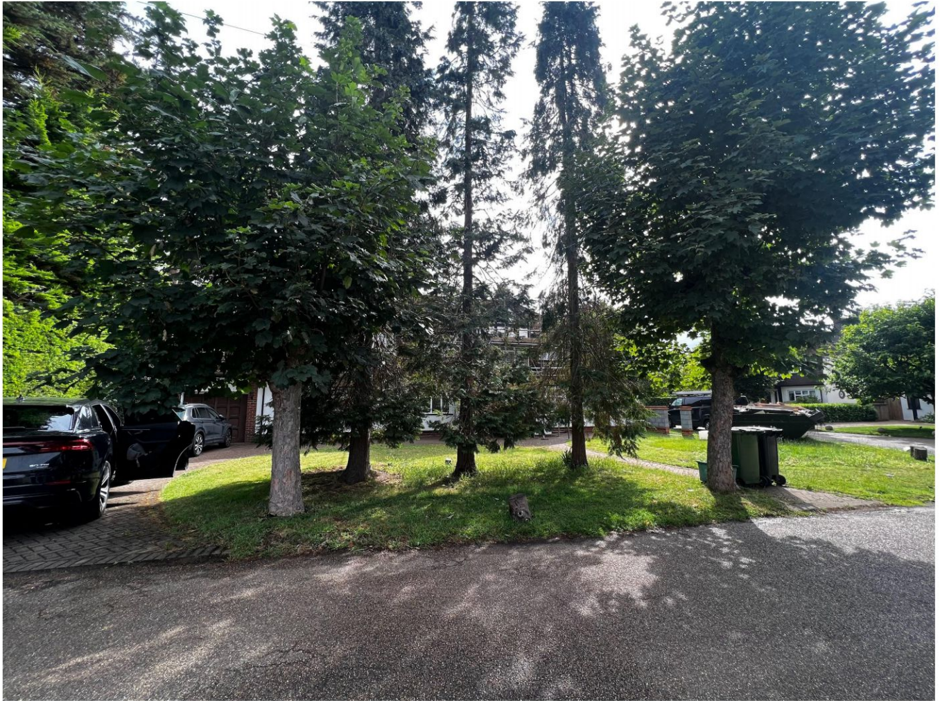
Roadside front elevation of property