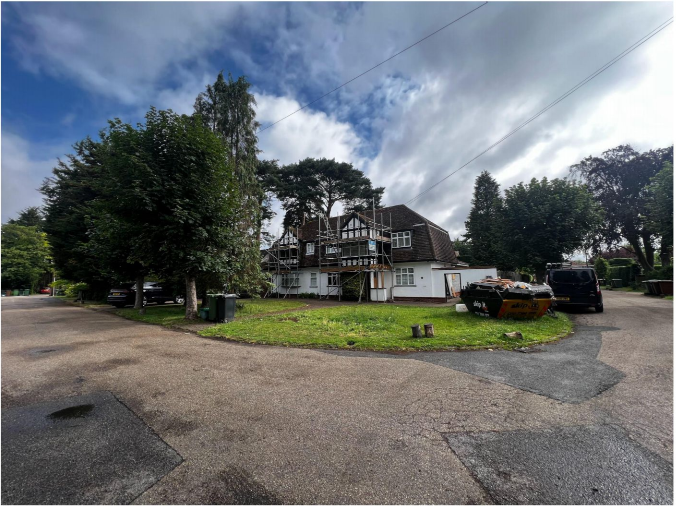
Roadside corner elevation of property