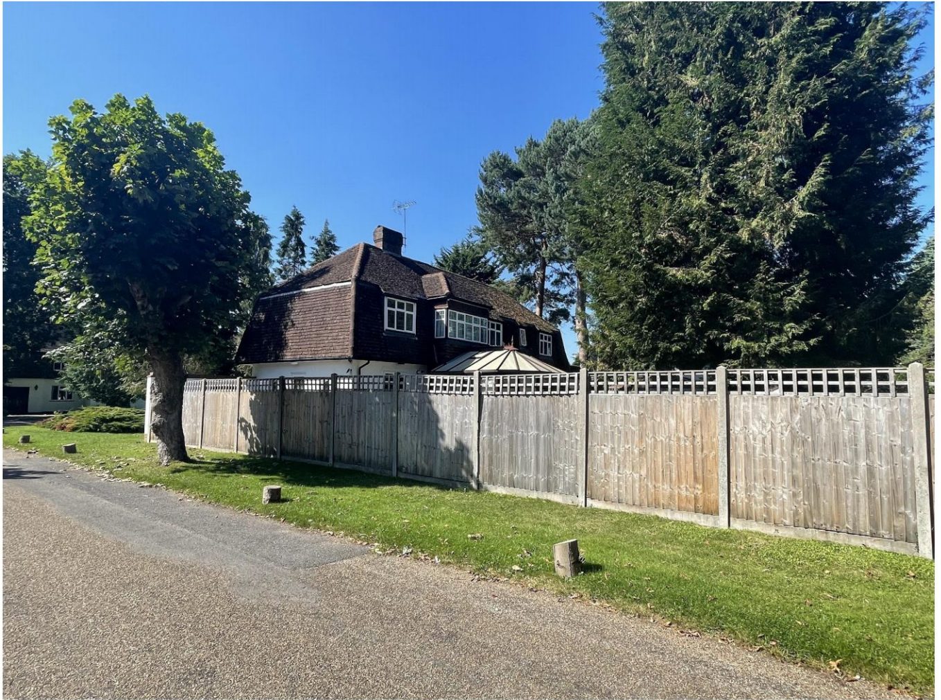
Rear corner elevation of property