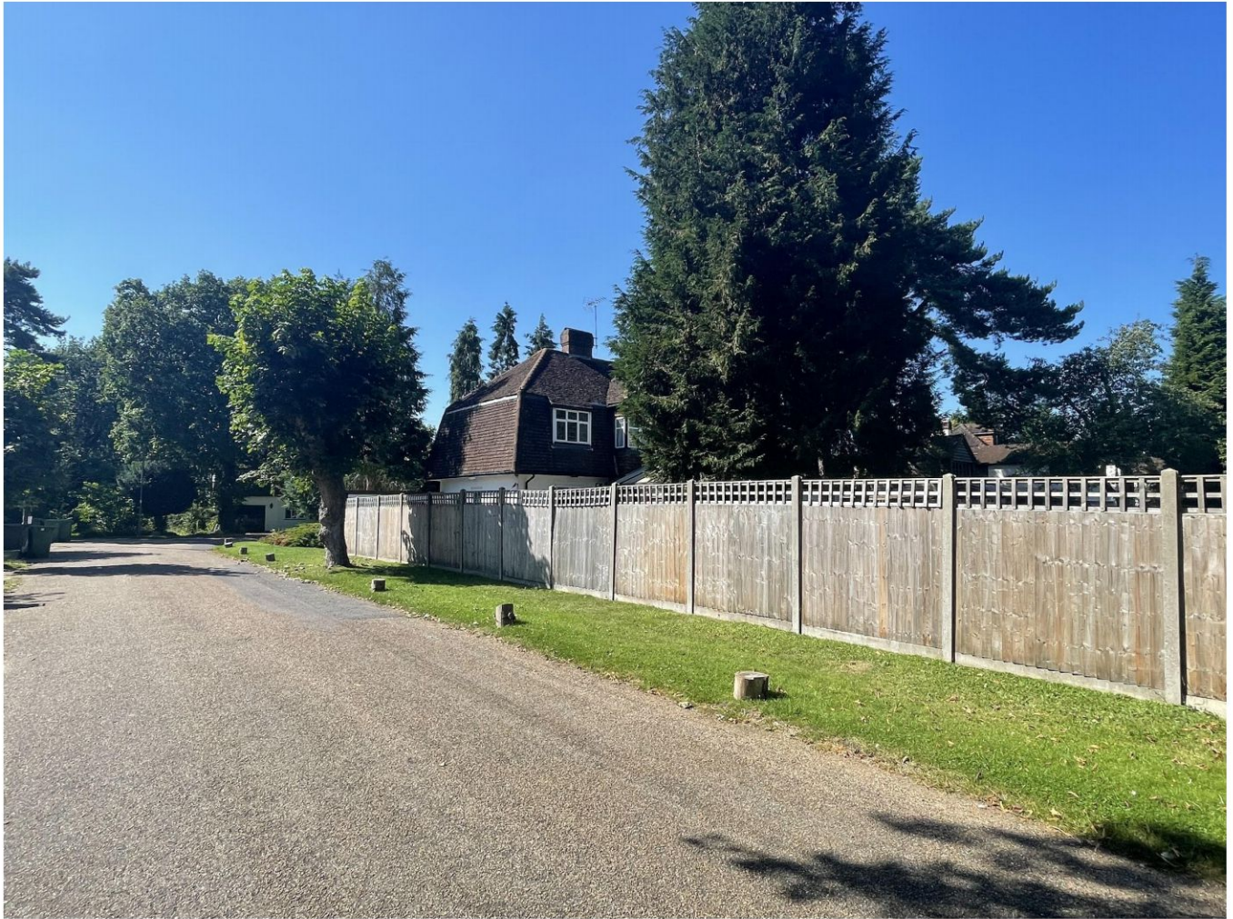
Roadside looking rear side of property