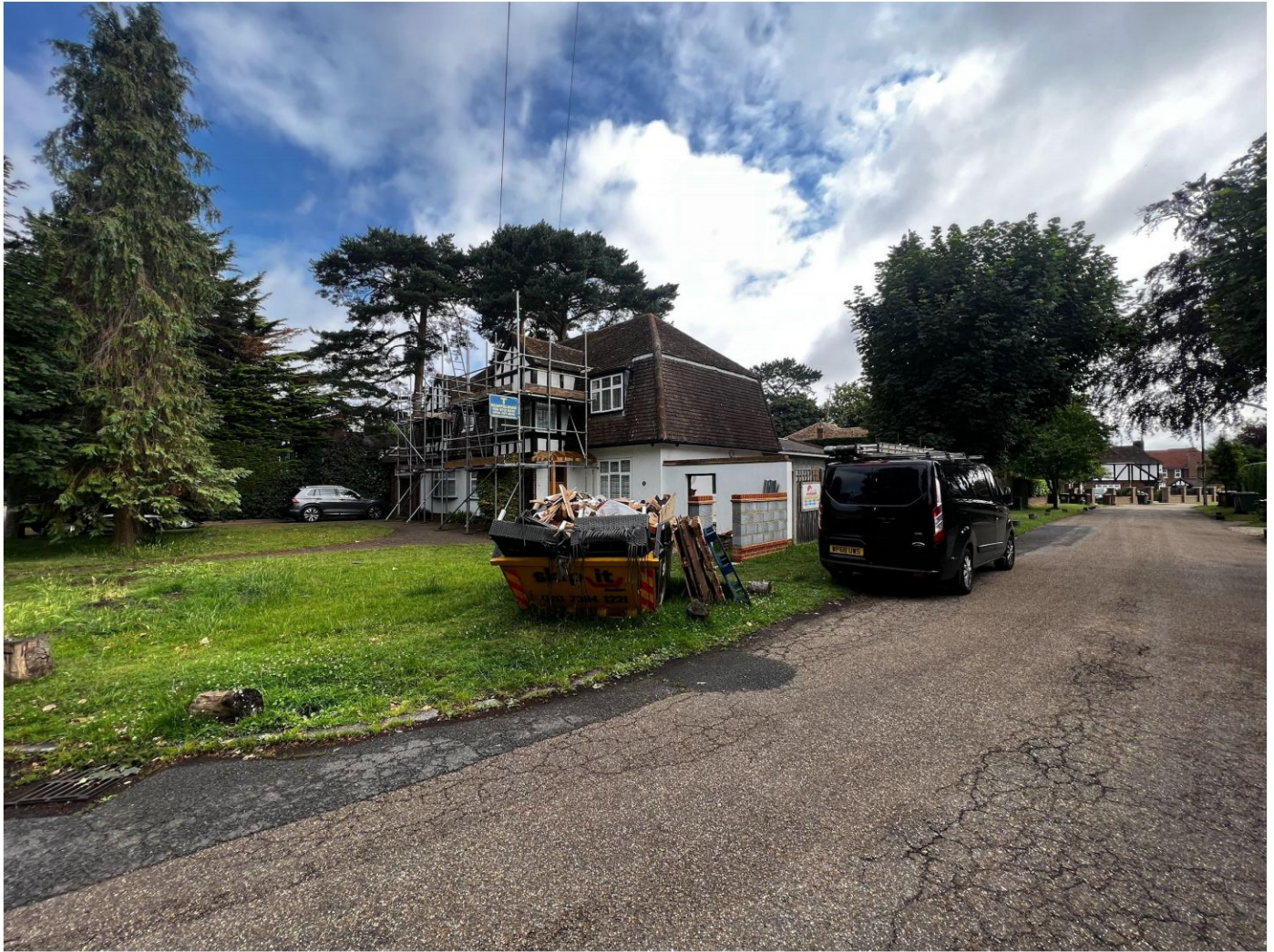
South corner elevation of property