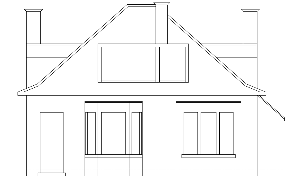
North Elevation (no change)