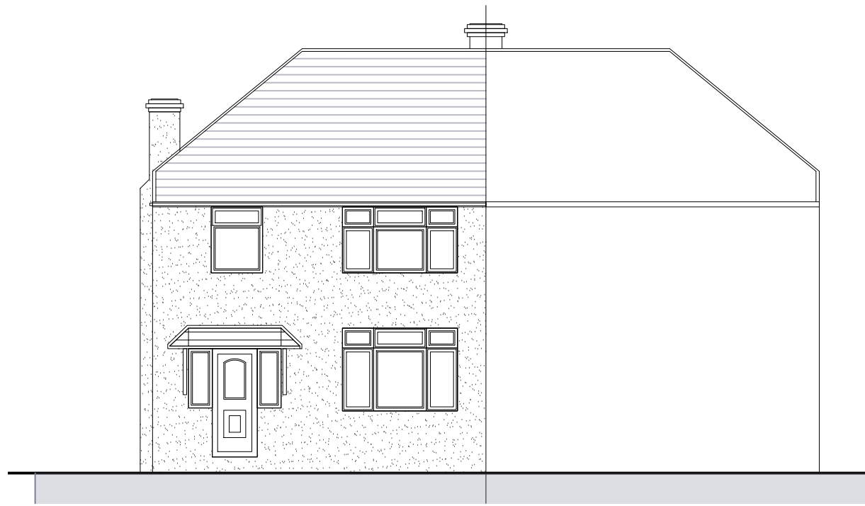
Proposed Front Elevation Scale 1:100