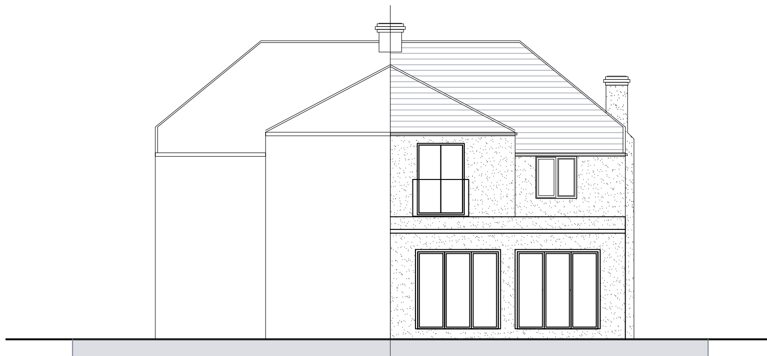
Proposed Rear Elevation Scale 1:100