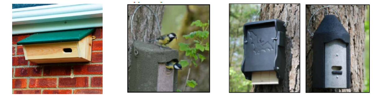
Swift and bird nesting boxes and bat boxes, as approved by RSPB

The ecological enhancements will provide opportunities to create habitat links along the existing boundaries to the surrounding area, provide new habitats, biodiversity within the site by planting native trees and hedgerows, to increase the value of the existing and proposed vegetation for wildlife and ecological benefits on the site. The use of fruit and nut bearing species; Nectar and pollen-rich species and long grass areas.