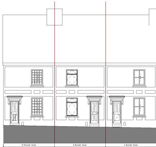
① Existing Front Elevation Scale 1:50

The property falls into a Conservation Area and as such the proposed windows will need to be in keeping with the area and its surrounding properties, and we believe that the proposed windows are that. The frames will be painted white to match the rest of the street.