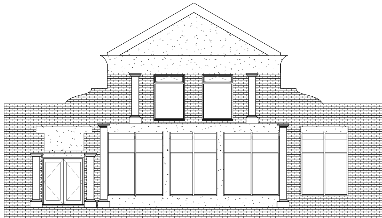
1 Front Existing 1 : 100