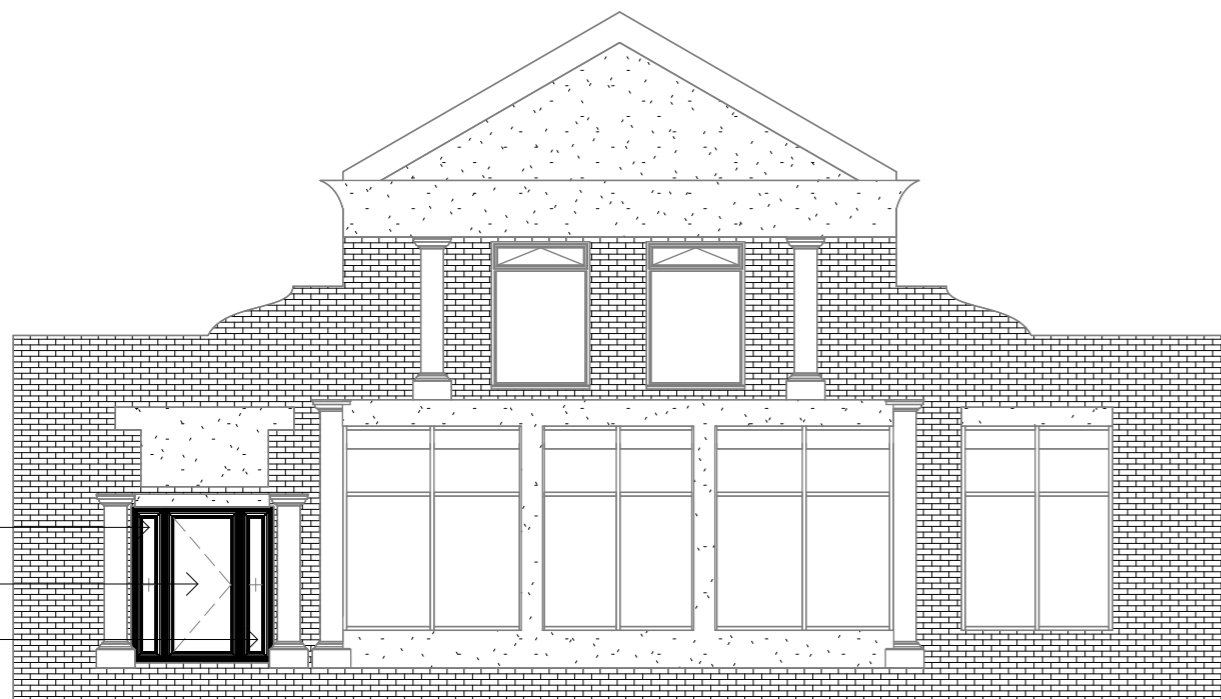
2 Front Proposed 1 : 100