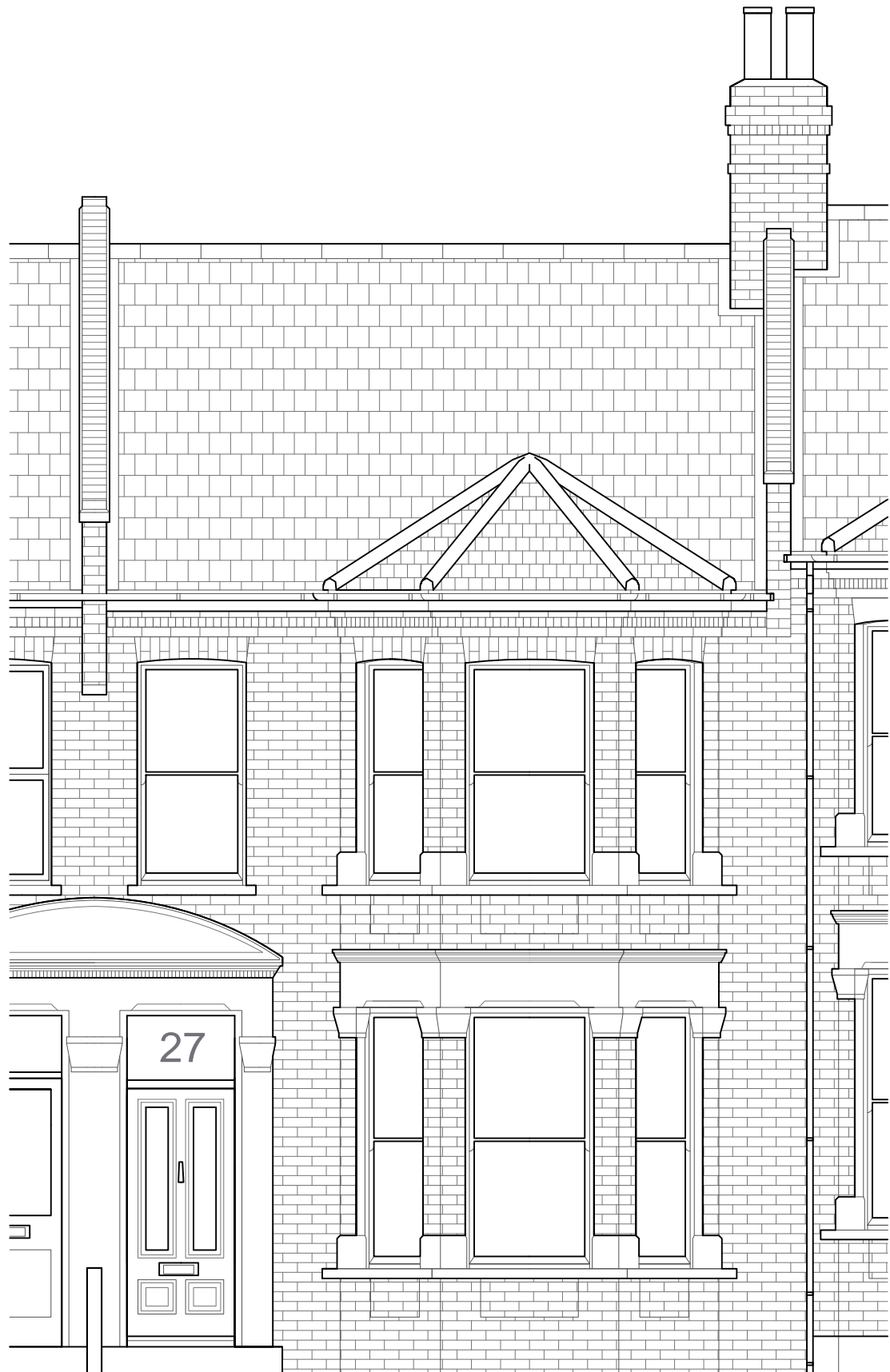
E EXISTING FRONT ELEVATION 01 SCALE 1/50