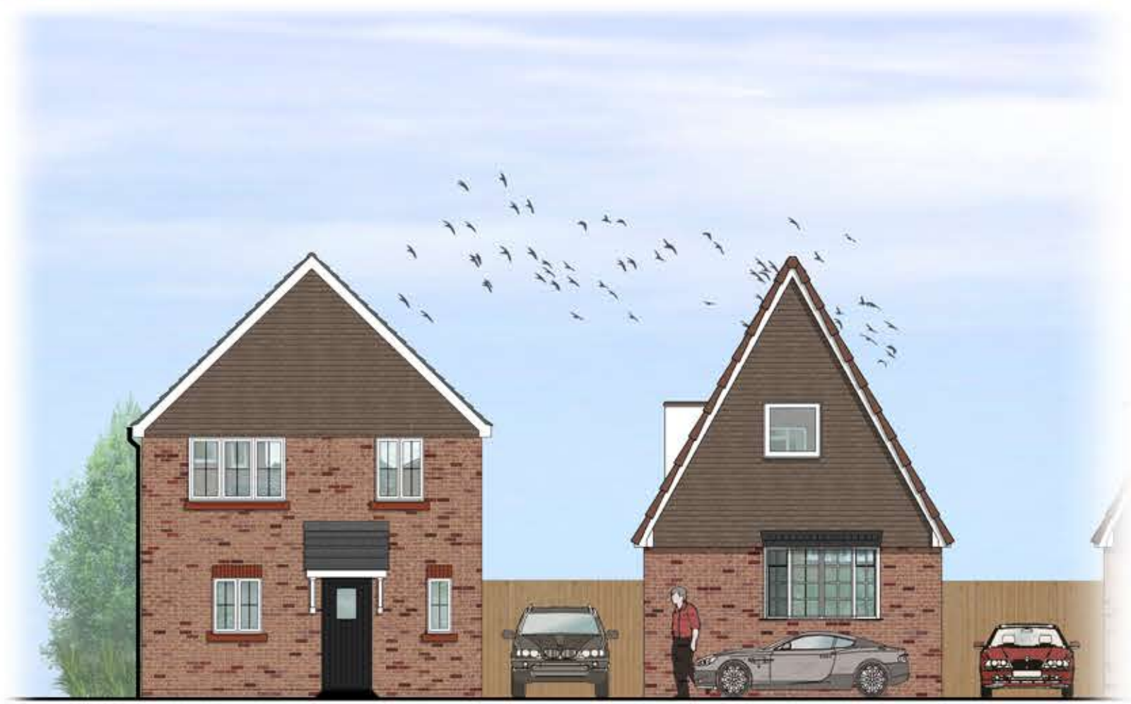
Street Scene BB