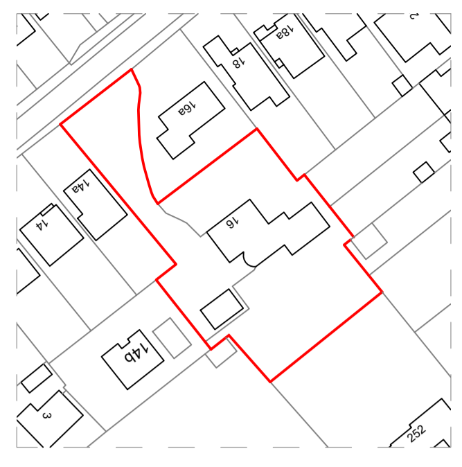
Existing Site Location Plan 1:1250