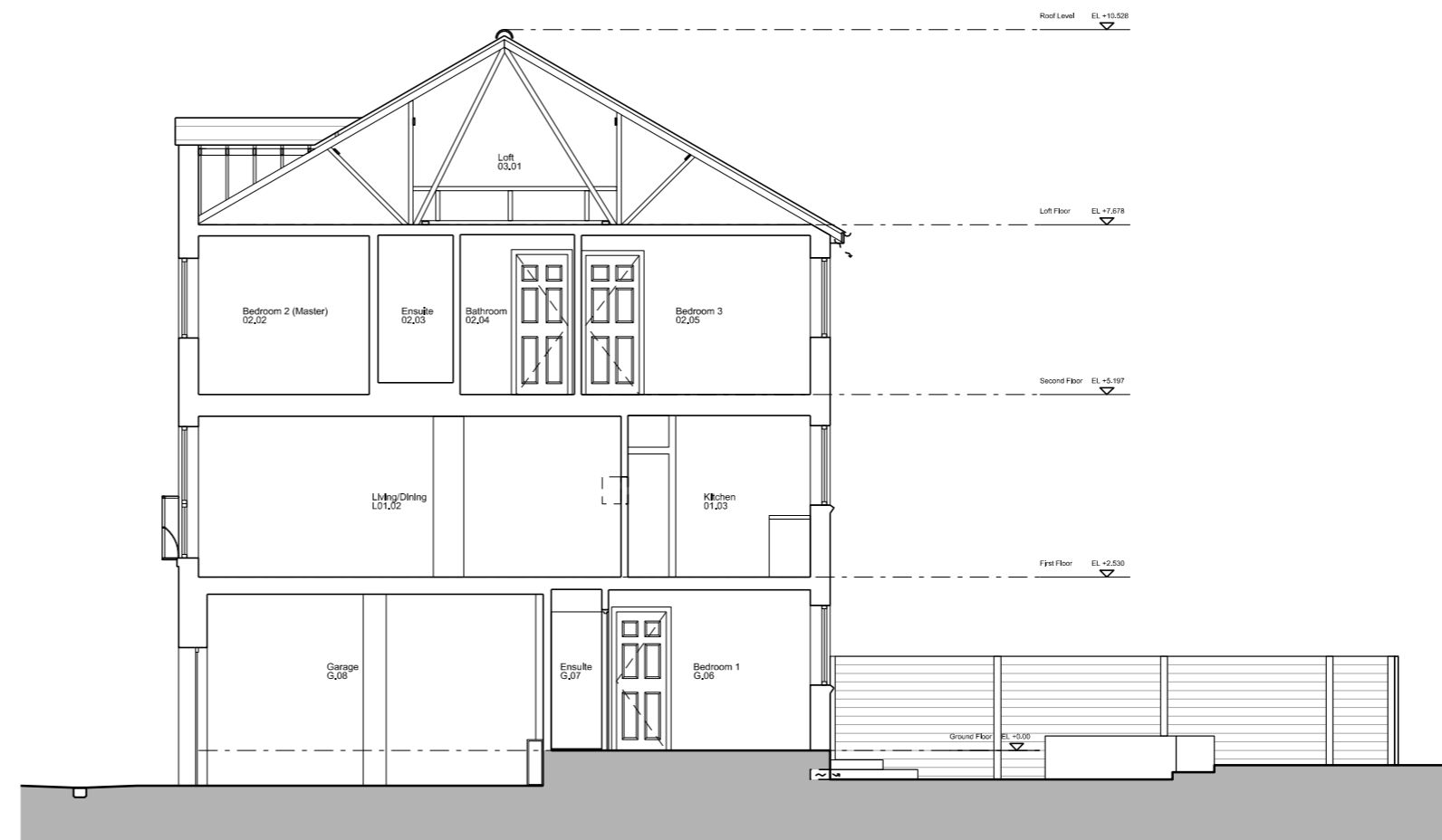
02 - EXISTING SECTION BB