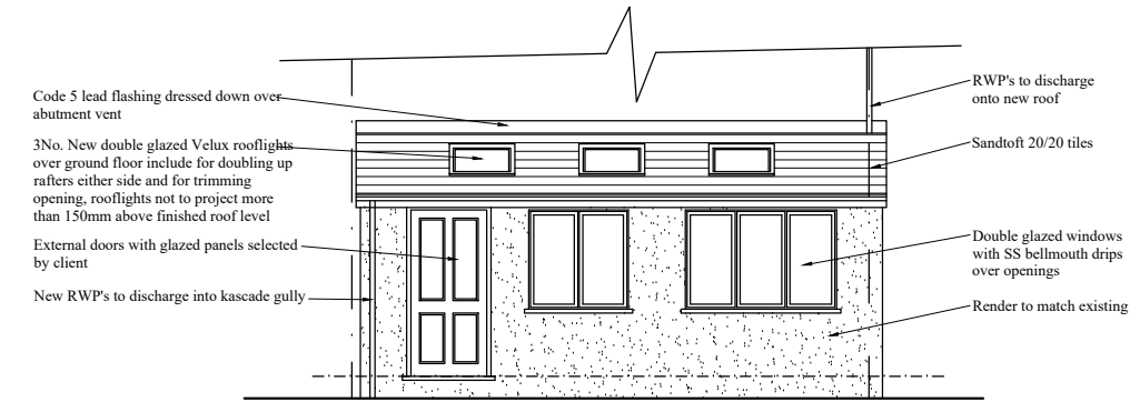
part rear elevation

3No. New double glazed Velux rooflights over ground floor