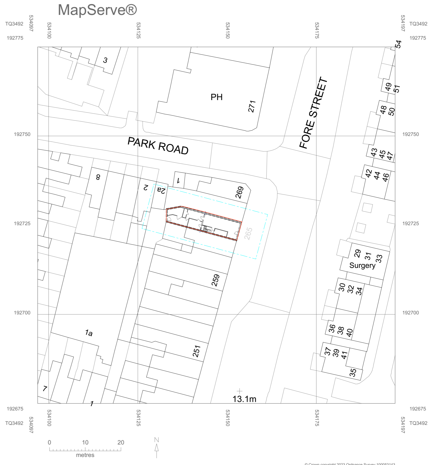
Existing Block Plan - Scale 1: 500 @A2