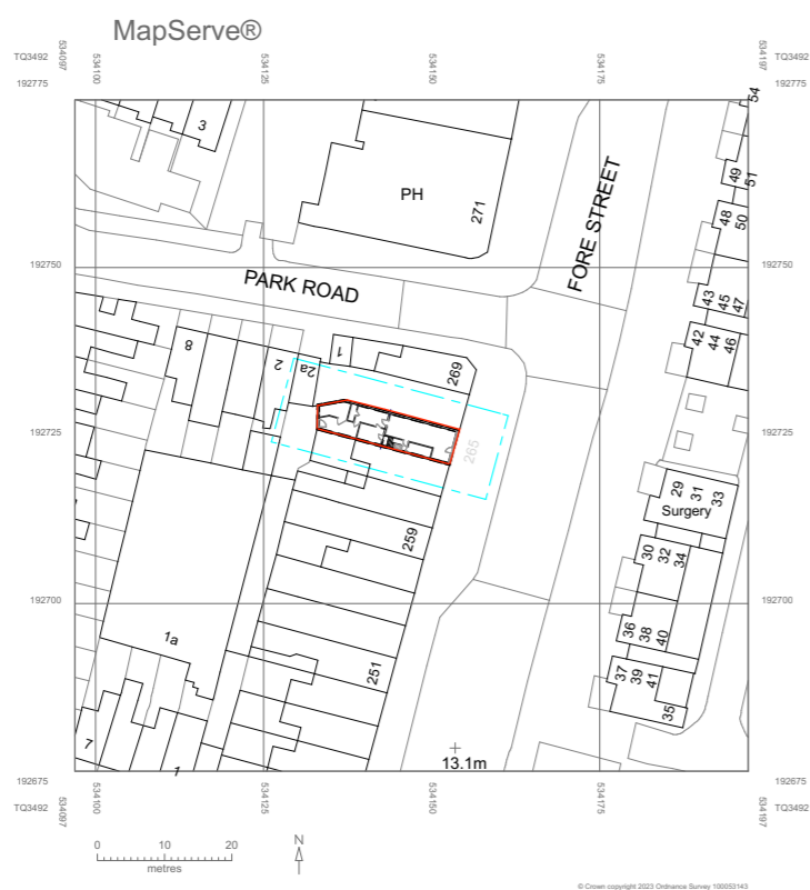
Site Location Plan - Scale 1: 1250 @A2