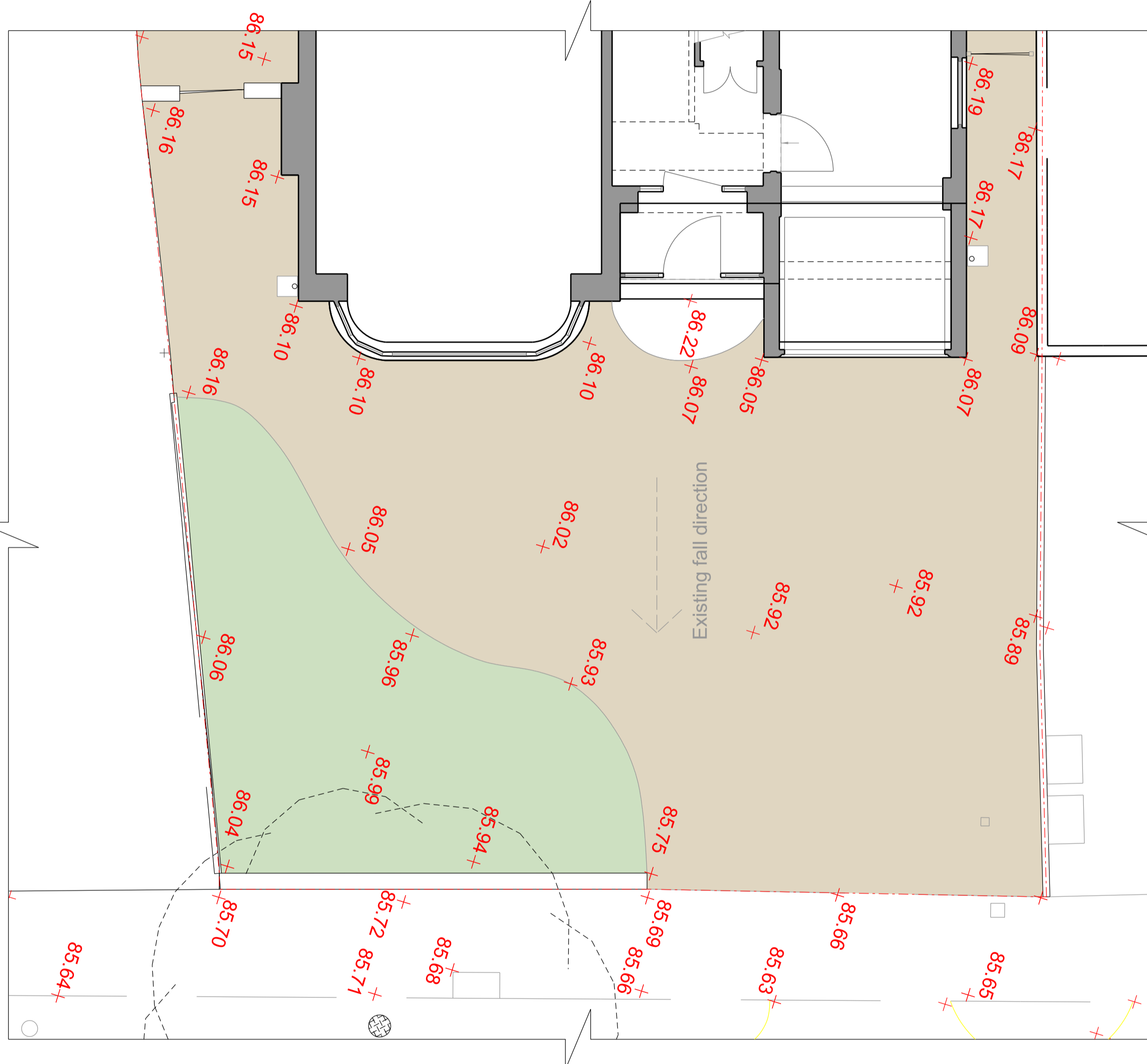
1 Existing Front Garden Plan