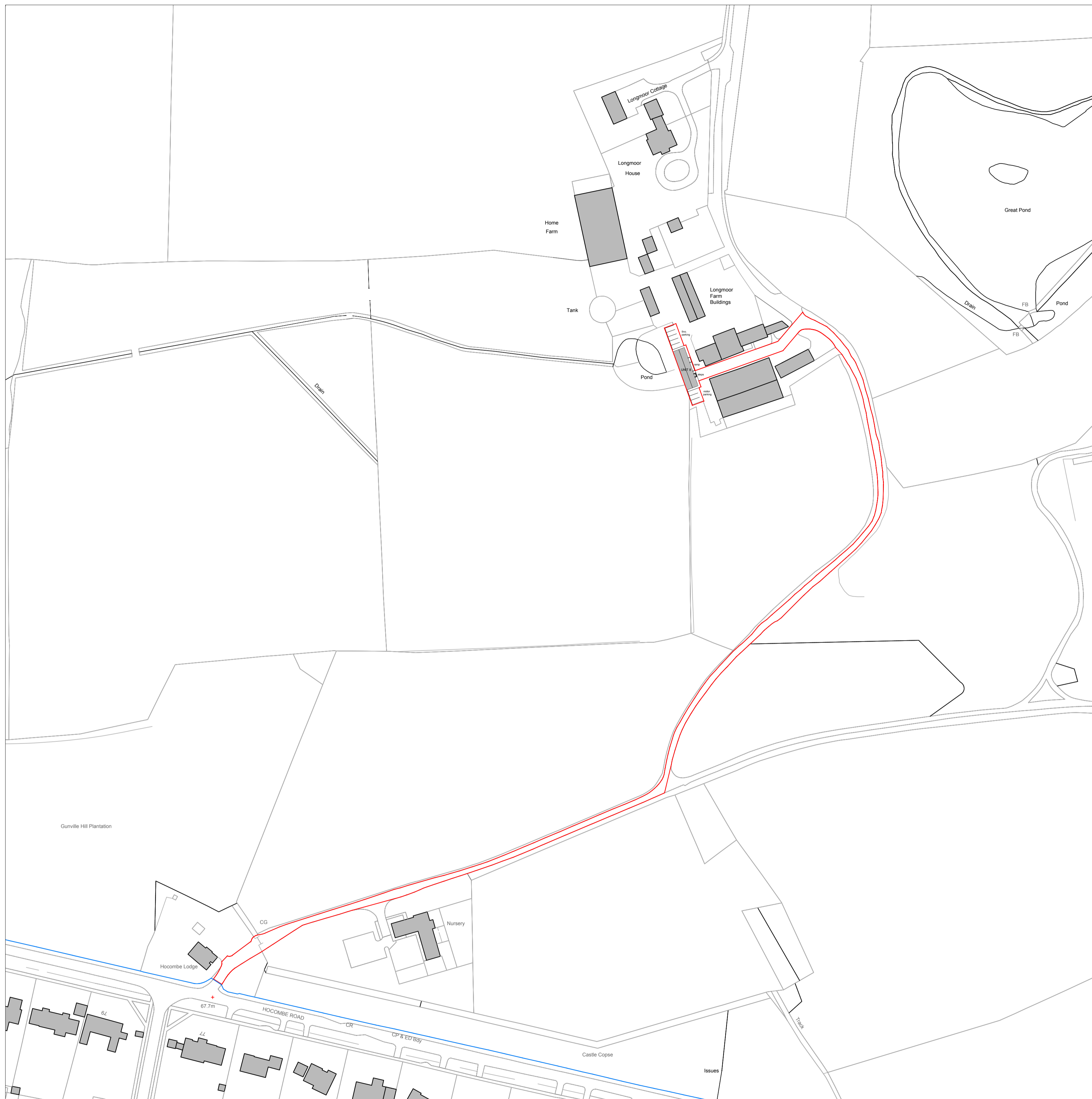
SITE LOCATION PLAN @ 1:1250

Streetwise licence No. 100047474 © Crown Copyright and database rights 2020 OS