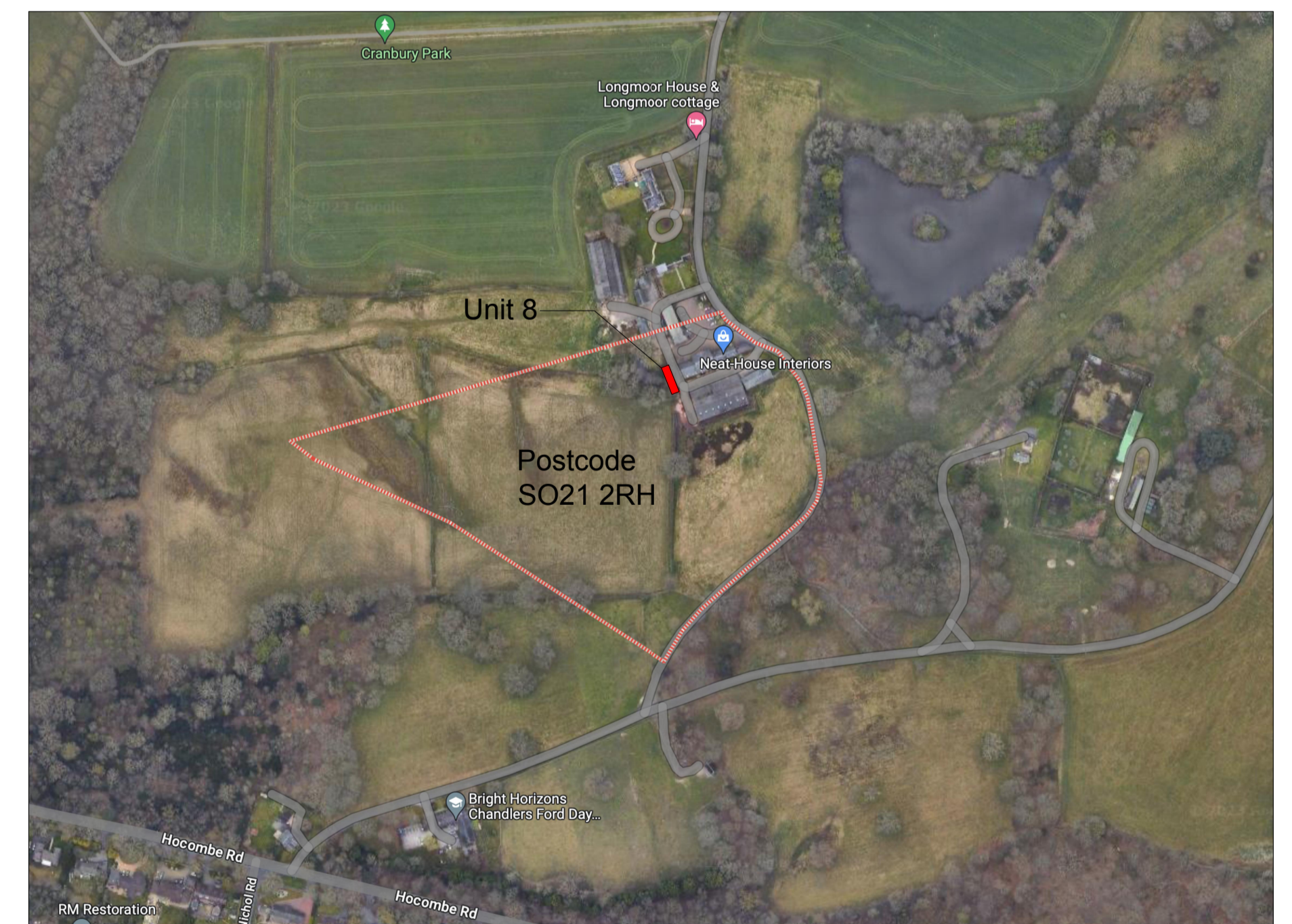
AERIAL LOCATION - Not to Scale

Notes Report any discrepancies to the author. Do not scale from this drawing. This drawing is copyrighted to Temple Ford Design LTD.