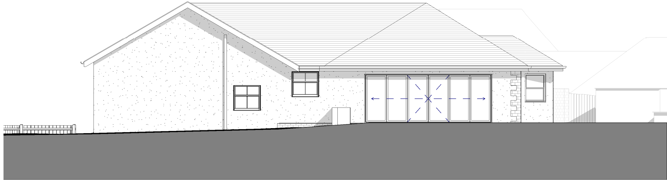
Existing North West 1 : 100