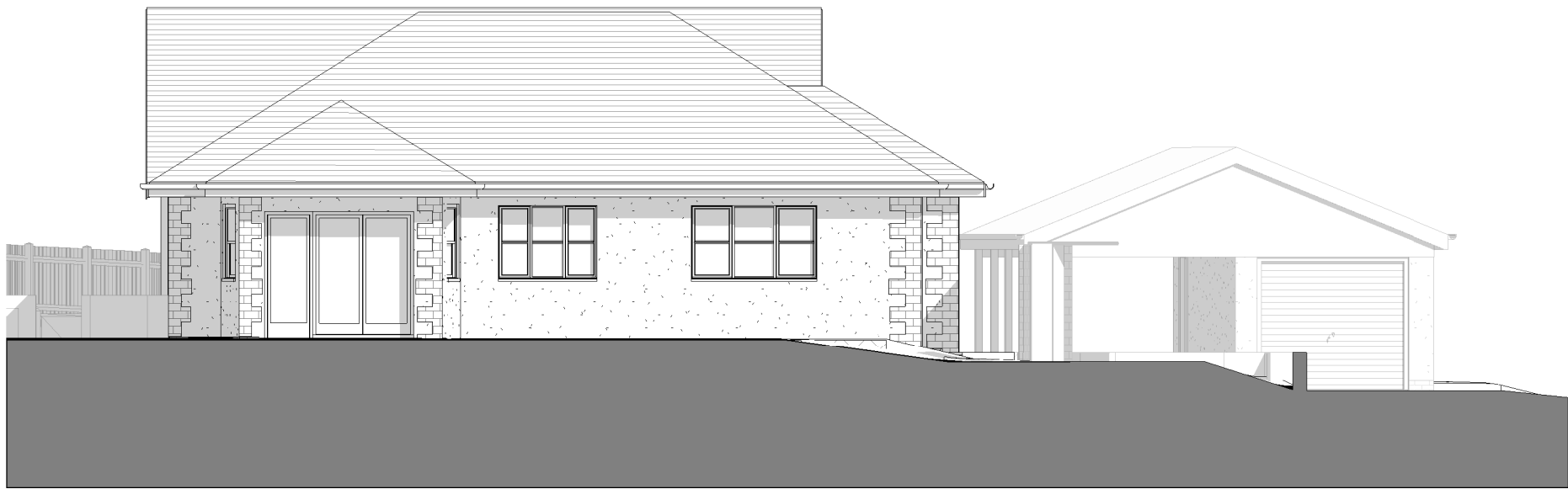
Existing South West 1 : 100