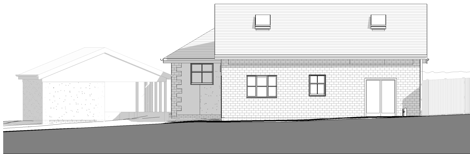
Existing North East 1 : 100