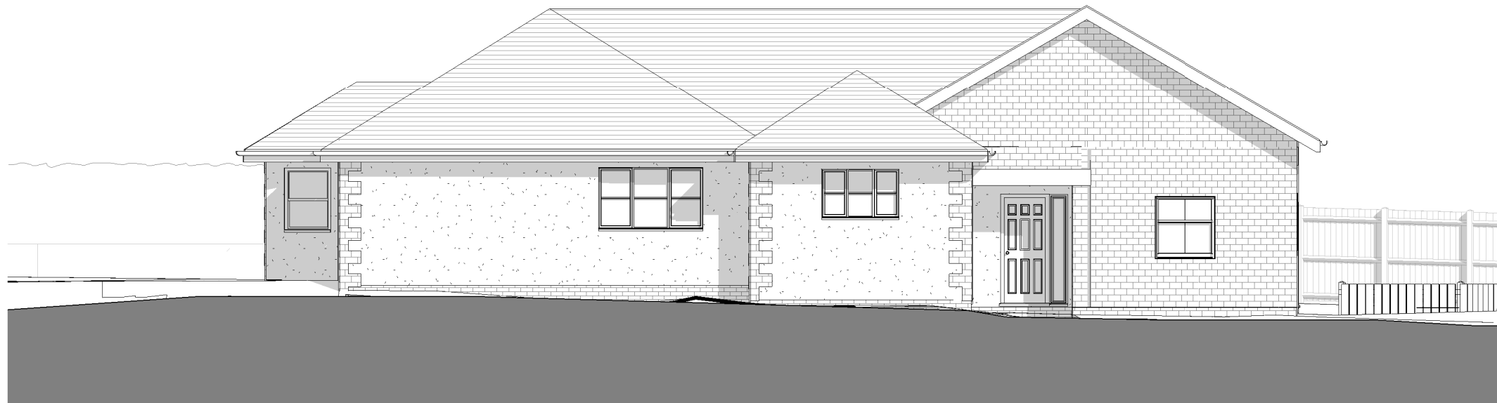
Existing South East 1 : 100