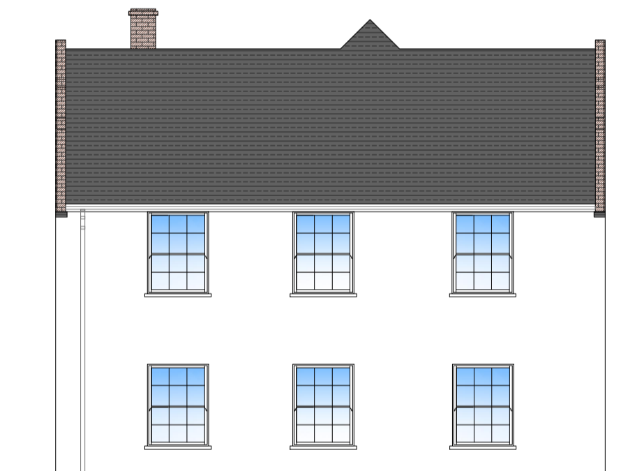
PROPOSED SIDE ELEVATION - View B Scale 1/100