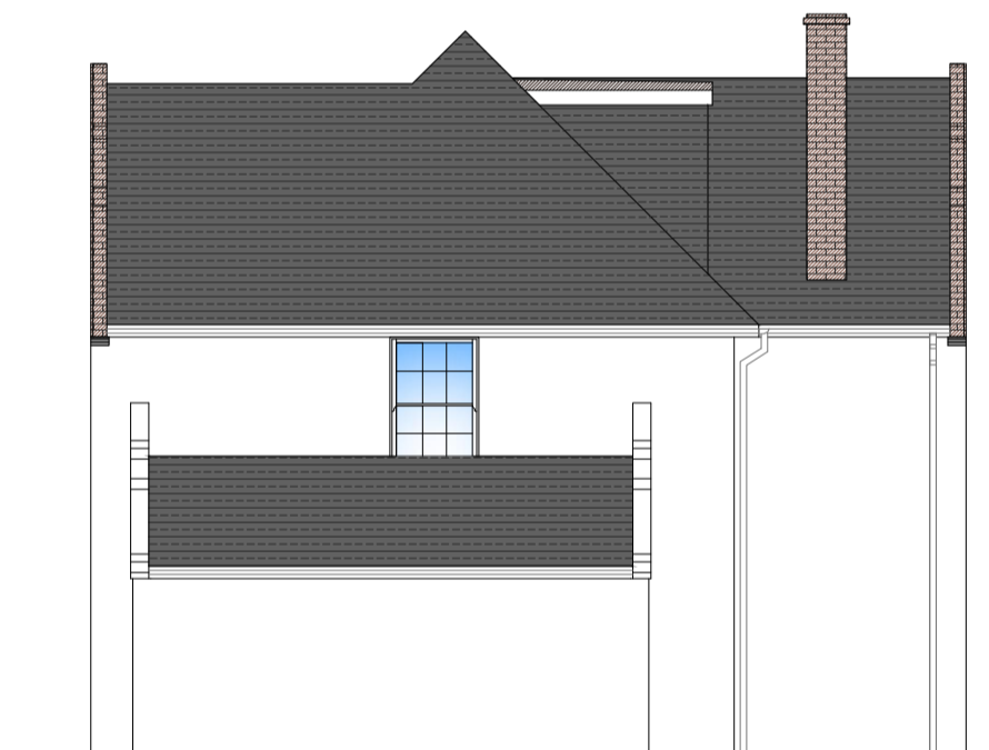
PROPOSED SIDE ELEVATION - View A Scale 1/100