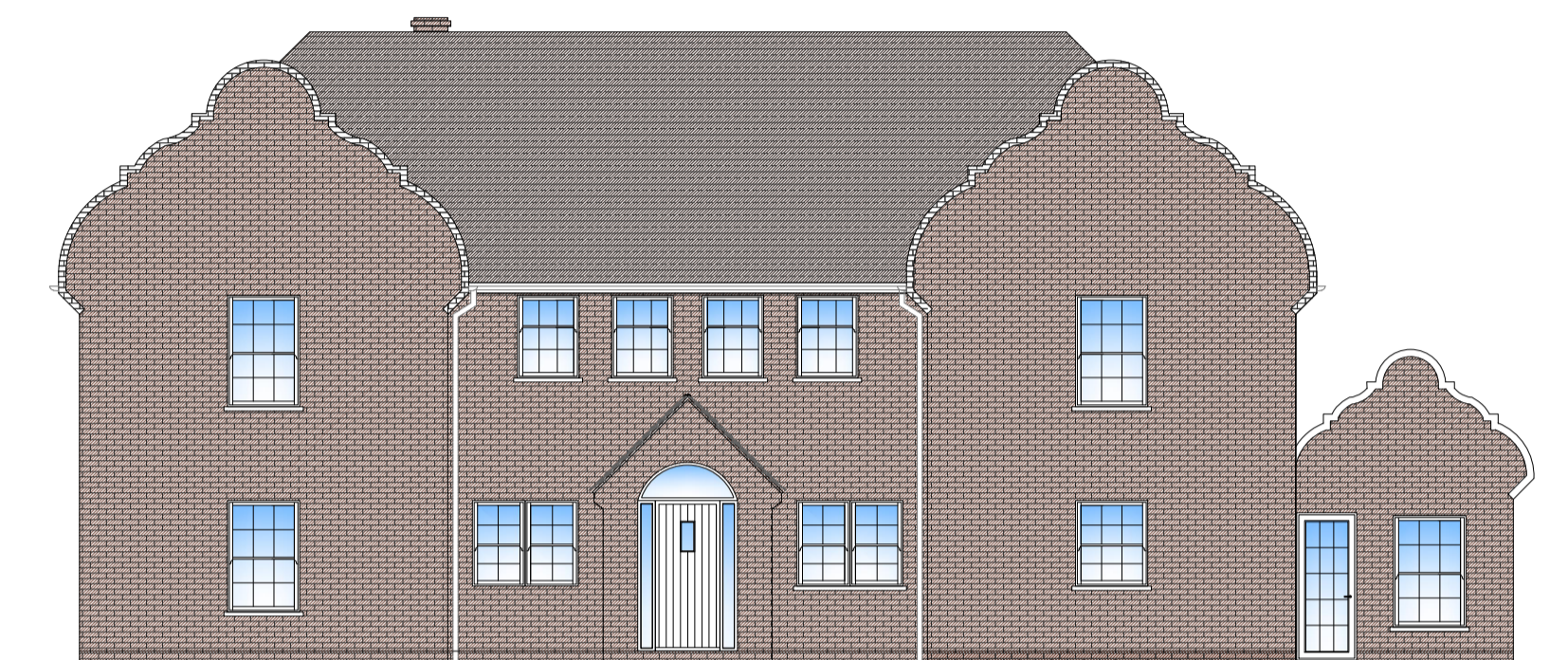
EXISTING FRONT ELEVATION Scale 1/100