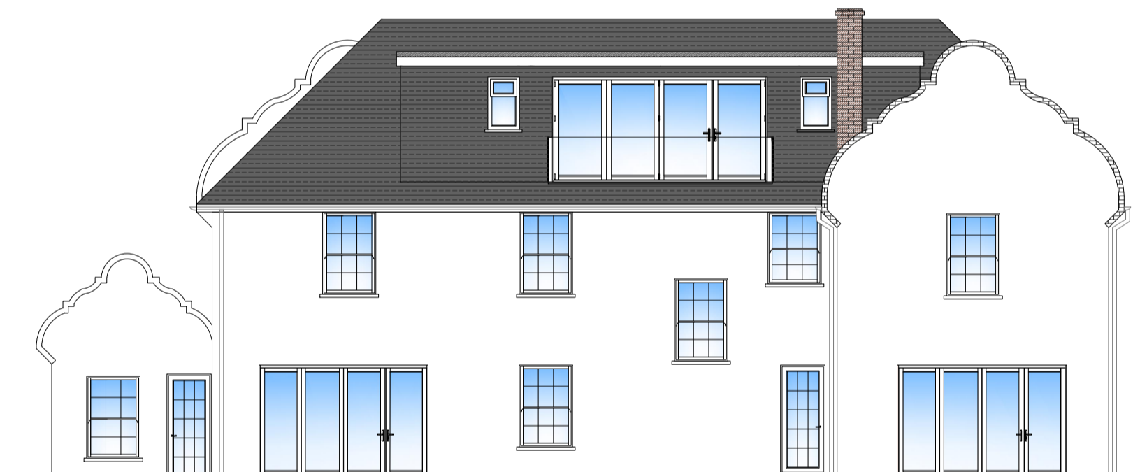
PROPOSED REAR ELEVATION Scale 1/100