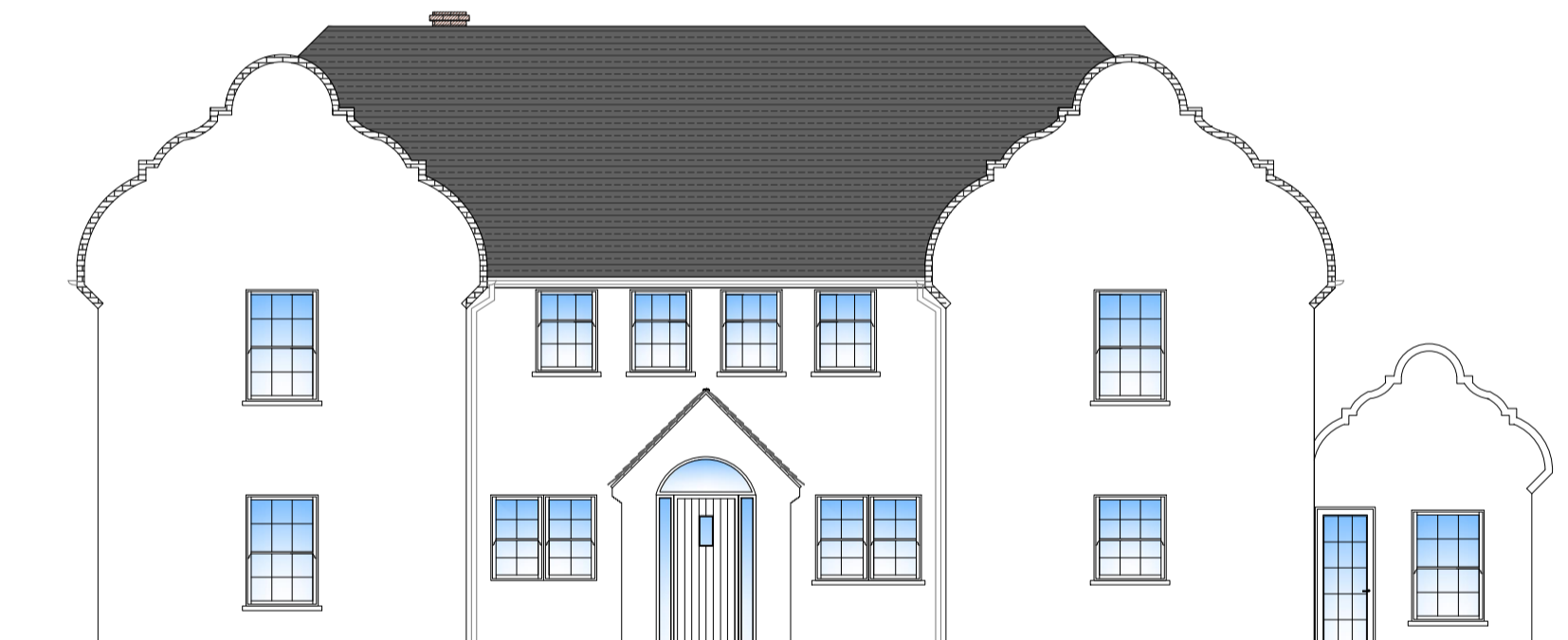
PROPOSED FRONT ELEVATION Scale 1/100