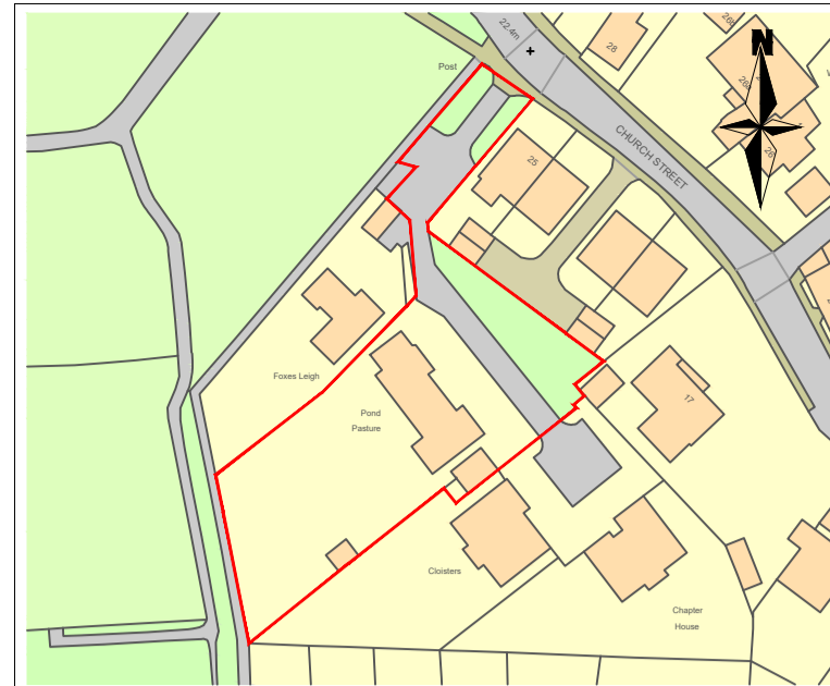
EXISTING SITE LOCATION PLAN - SCALE 1/1250