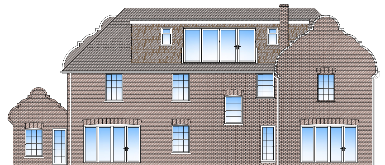
EXISTING REAR ELEVATION Scale 1/100